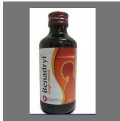
Benadryl C Formula Syrup