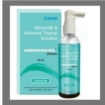
Androanagen Solution Topics