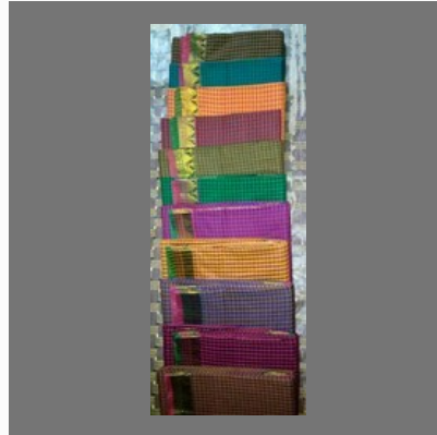
Temple Border Checks Saree