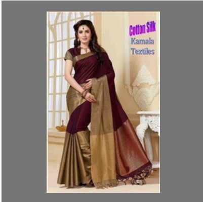
Black And Golden Color Cotton Silk Saree