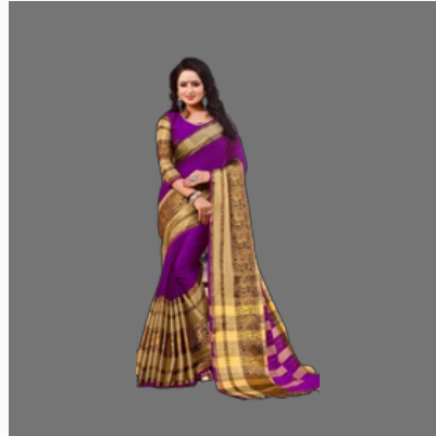
Cotton Silk Saree