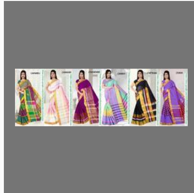
Cotton Sarees C Series