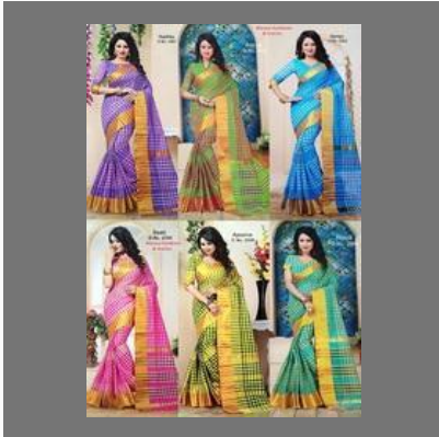
Cotton Checks Fancy And Designer Sarees