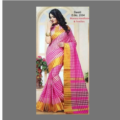
Pink With Golden Printed Cotton Saree