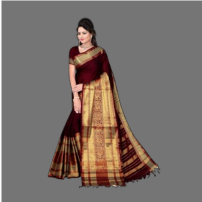
Cotton Silk Mercerised Saree