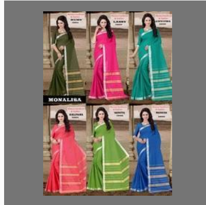
Cotton Fancy Jacquard Designer Plain Sarees