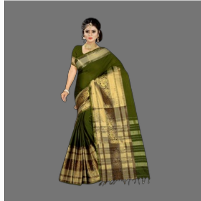
Cotton Silk Mercerized Sarees