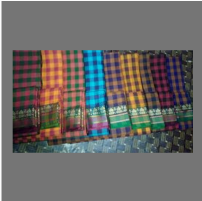
Cotton Checks Saree