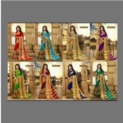
Kabali Silk Jacquard Saree