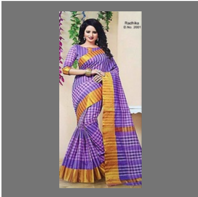
Purple Printed Cotton Saree