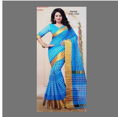
Blue Dot Printed Cotton Saree