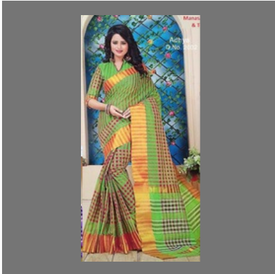
Light Green Printed Cotton Saree