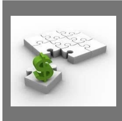
Stock and Receivables Services