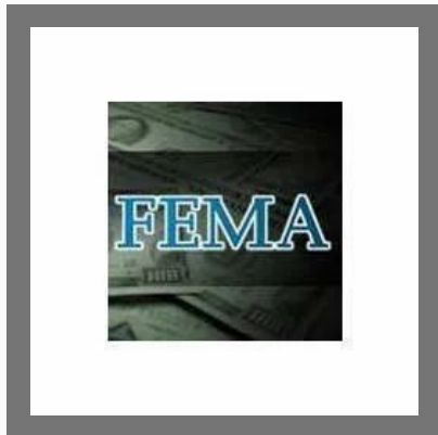
Foreign Exchange Management Act (FEMA) Services