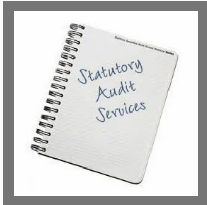
Statutory Audits Services