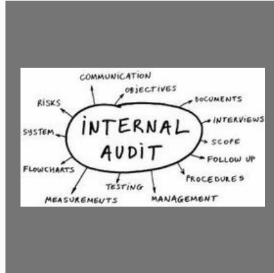
Internal Auditing Services