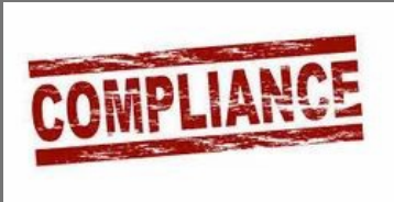
Statutory / Regulatory Compliance Services