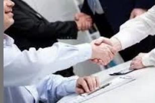
Merger / Acquisition Services