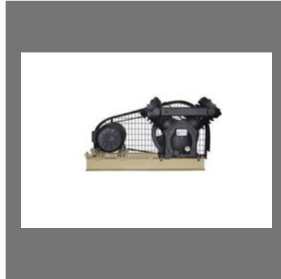
Single Stage Dry Vacuum Pumps