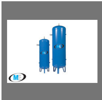
Vertical Type Air Receiver Tank