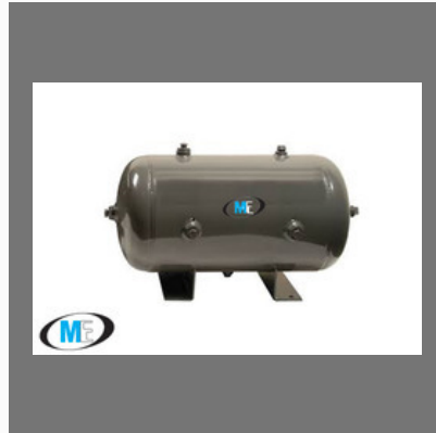
Horizontal Type Air Receiver Tank