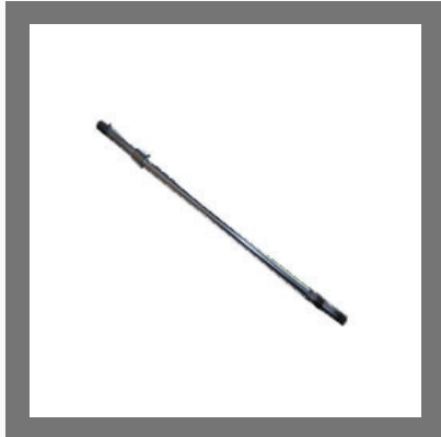
Air Compressor Piston Rod