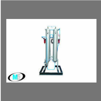
Heatless Air Dryer