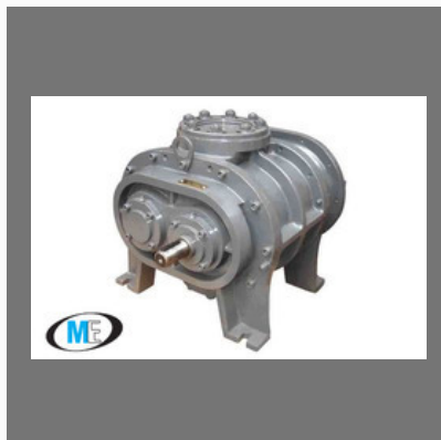
Twin Lobe Root Blower