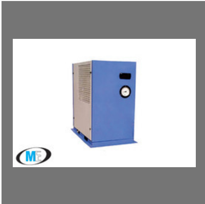
High Pressure Refrigerated Air Dryer