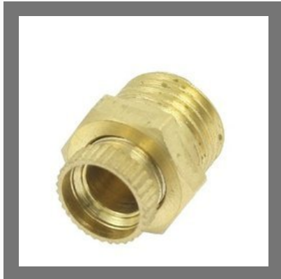
Air Compressor Metal Valve