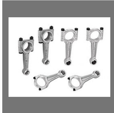
Air Compressor Connecting Rods