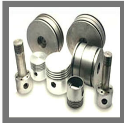
Air Compressor Pistons