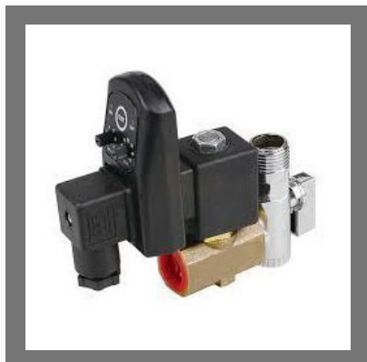
Electric Timer Auto Drain Valve