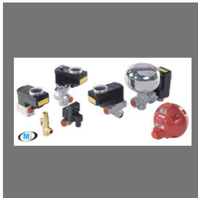
Mechanical Auto Drain Valve