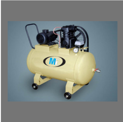
Single Stage Air Compressors