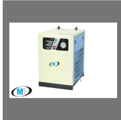
Low Pressure Refrigerated Air Dryer