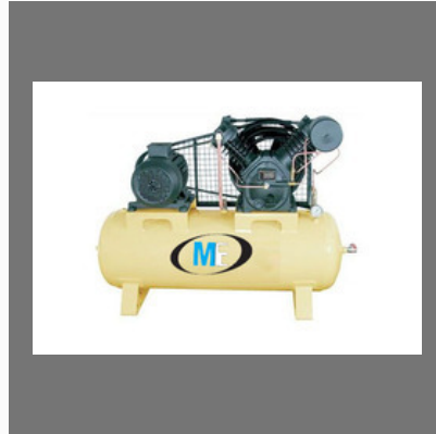
Two Stage Air Compressors