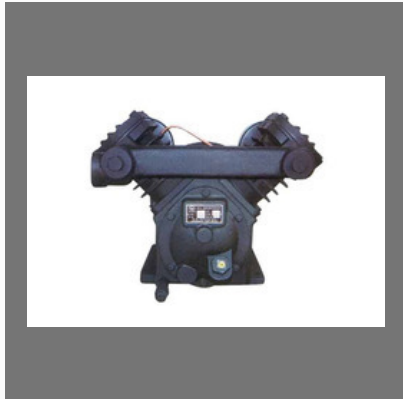
Two Stage Dry Vacuum Pump