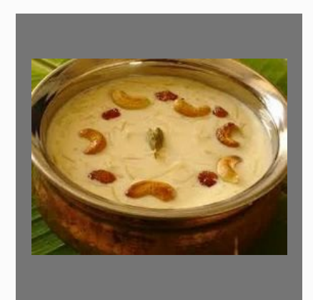
Badhusha Processed Food