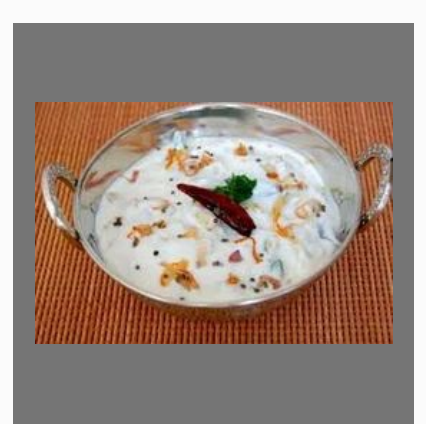
Kichadi Processed Food