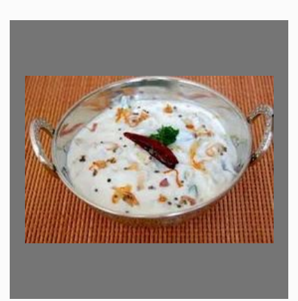
Kurukku Kalan Processed Food