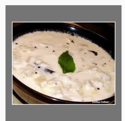
Pachadi Processed Food