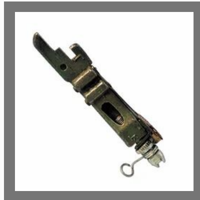
Brake Shoe Adjuster Kit