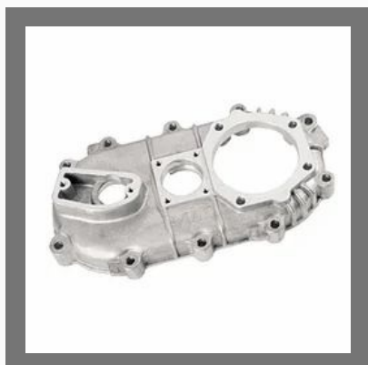
Engine Side Cover