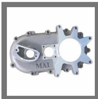
Engine Side Cover Ape Bs III