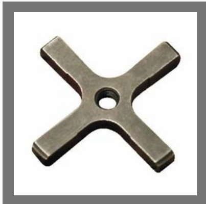
Gear Cross OE