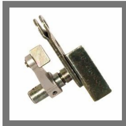
Reverse Gear Assembly O E