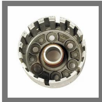
Clutch Bell Alfa BS III