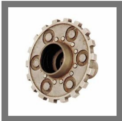
Bush Plate BS III