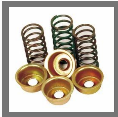
Clutch Spring Cup Set