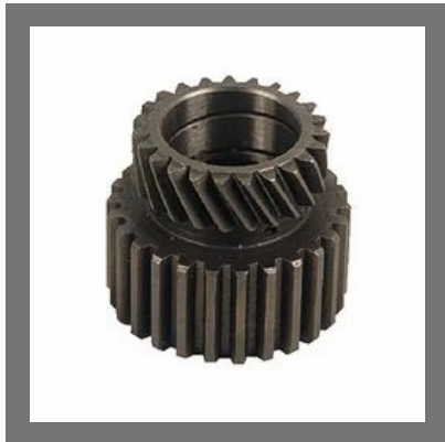
Engine Gear O E