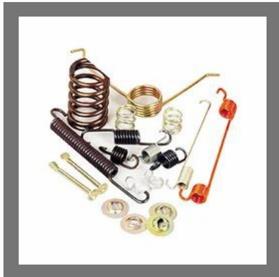
Spring All Type