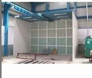
Wet Type Paint Booth