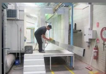
Powder Coating Booth