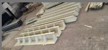
Ms Fabricated Material