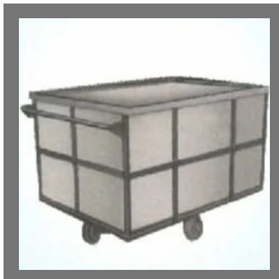
Material Handling Bins