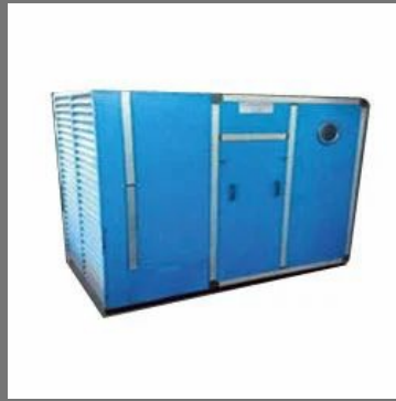
Air Supply Unit Fabrication Work