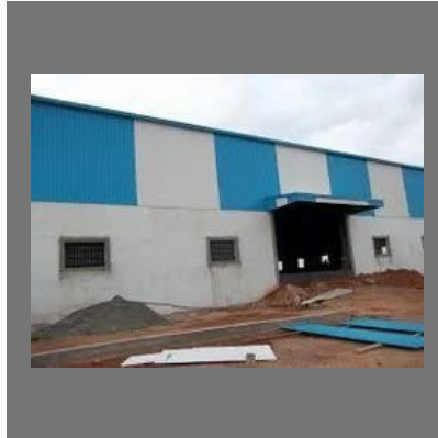
Prefabricated Industrial Sheds