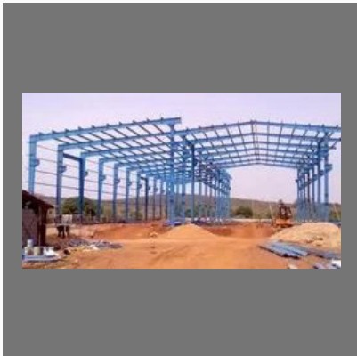
Steel PEB Building Structure Fabrication