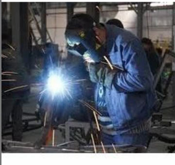
Stainless Steel Supply Fabrication