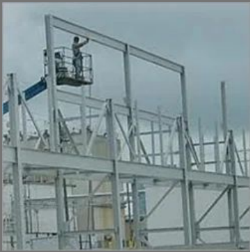
Prefab Industrial Building Fabrication