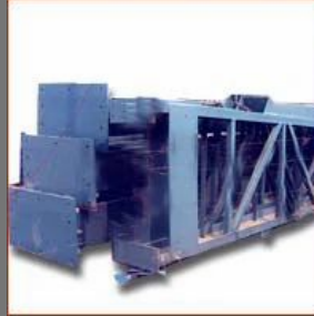
Heavy Structural Steel Fabrication Service