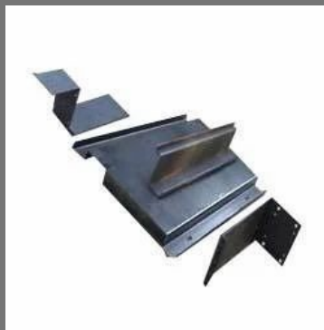
Sheet Metal Component