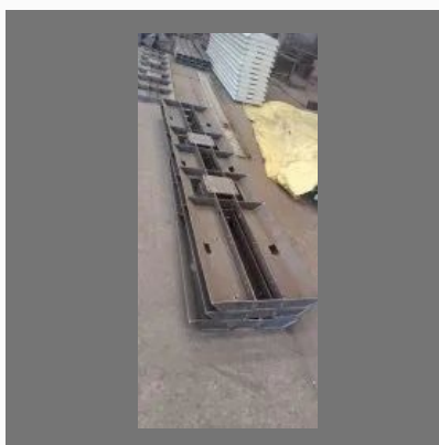
Steel Fabricated Material