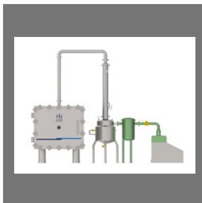
Vacuum Tray Dryer