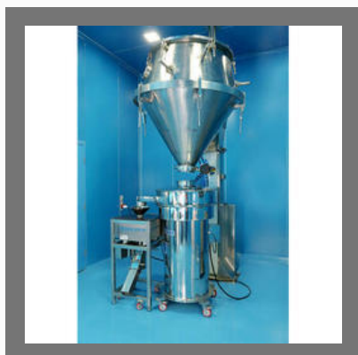
Lifting And Tipping Device