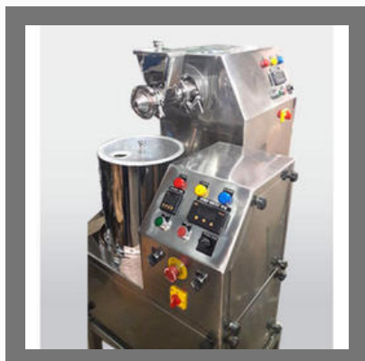
Extruder & Spheronizer