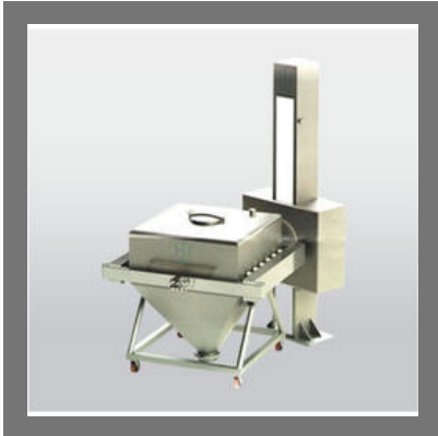
Conta Pillar Blender / Pillar Type Blender/ Bin Blender