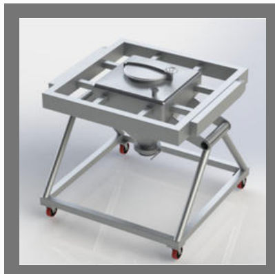
Square Bin IPC Container