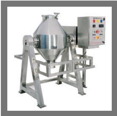
Double Cone Blender