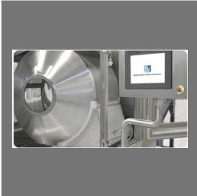
Auto Coater/Automatic Tablet Coating/Coating Pallets/Coating Tablets/Coating Granules