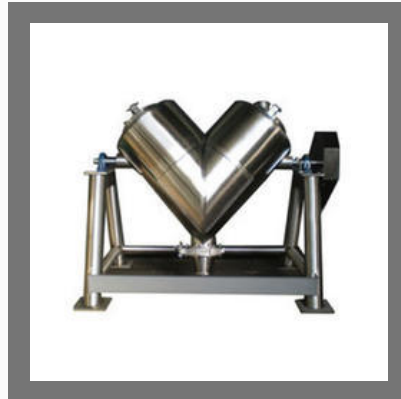
V Cone Blender