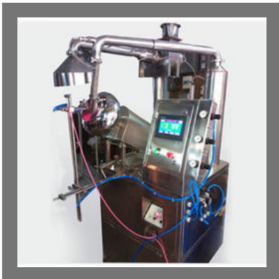
Conventional Coating Pan