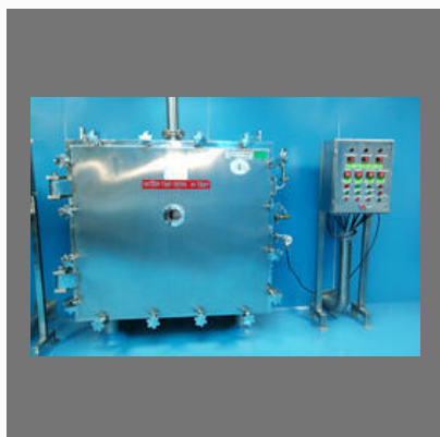
Vacuum Tray Dryer