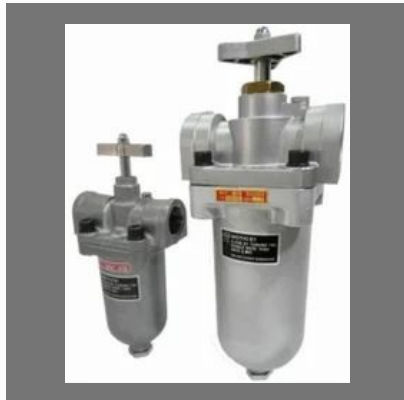
Naniwa Oil Filter