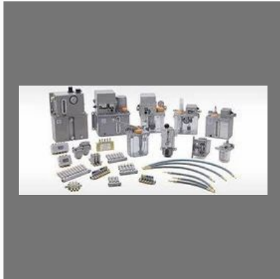
Lube Systems & Accessories