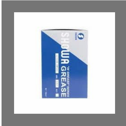
Showa, Japan Lithium Grease for Injection Molding Machine