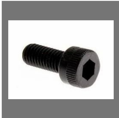
Socket Head Cap Screw