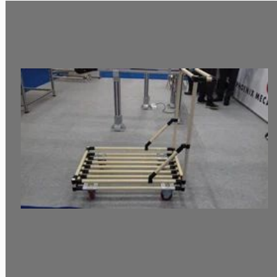
Pipe Joint Trolley