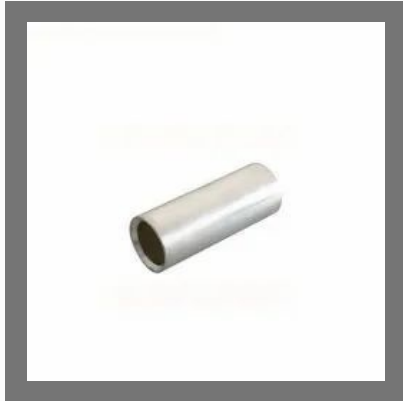
Aluminum Inline Connector