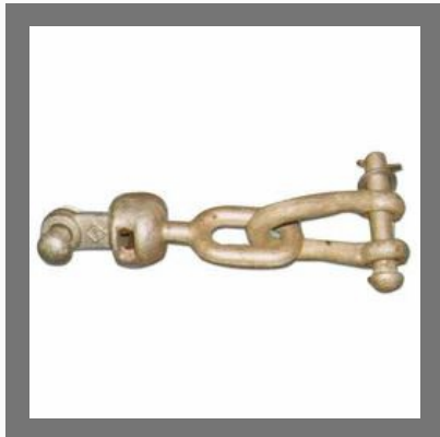
D Shackle Ball Link and Socket