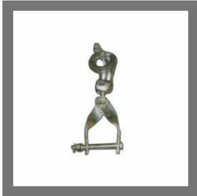
Disc Hardware Fittings