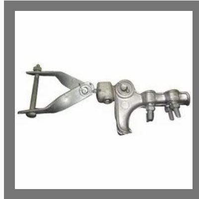
11KV Disc Hardware Fitting