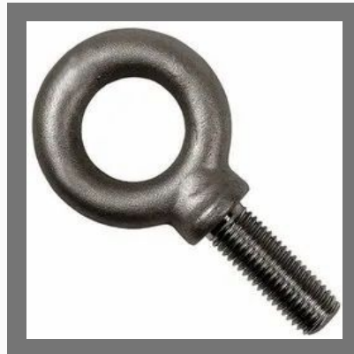
Stainless Steel Eye Bolt