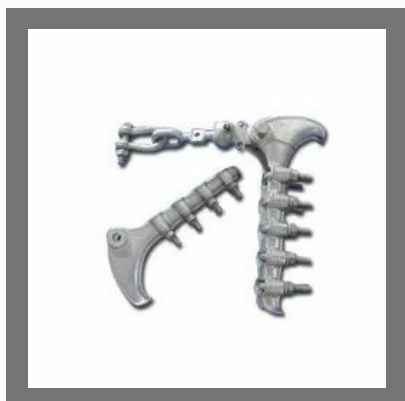
Single Tension Clamp