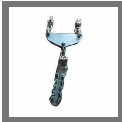
Double Tension Hardware Fittings