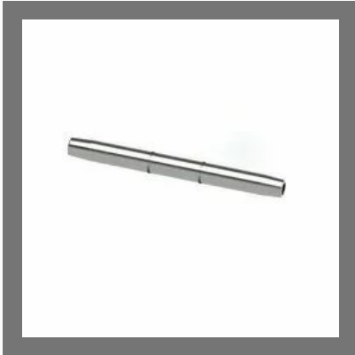
Mid Span Joints