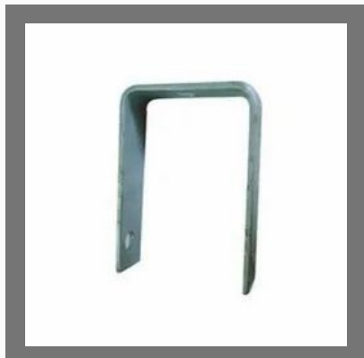
D Iron Clamp