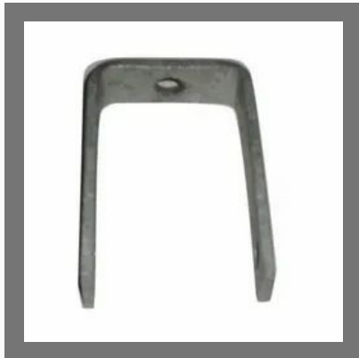
D Iron Clamp