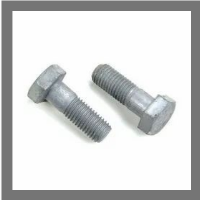
MS Galvanized Bolts