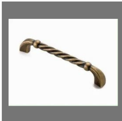
Pressure Die Casting Die