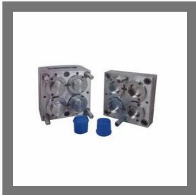
Bam Container Die