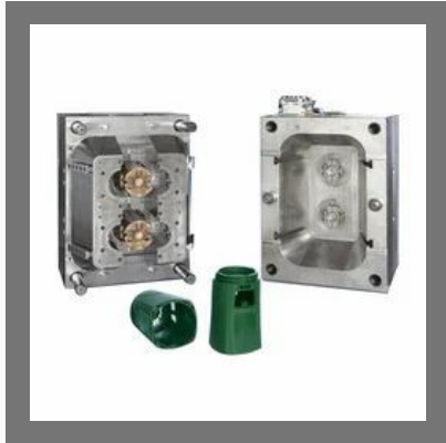
Plastic Injection Mould