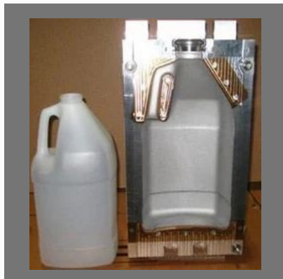
Blowing Die 5 Litter