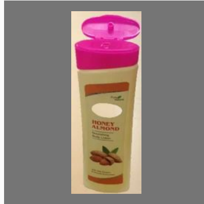
Sampoo & Lotion Bottle Flip Top Cap & Bottle Moulds