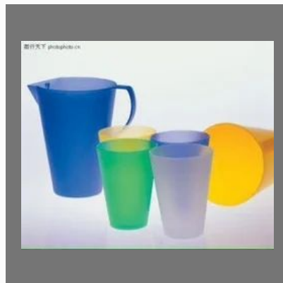
Plastic Glass Mould