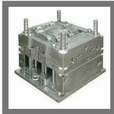
Plastic Die Mould