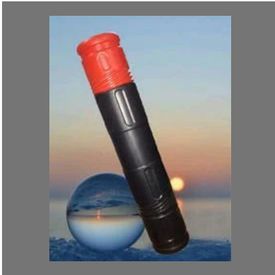
Drowning Sheet Cover Mould