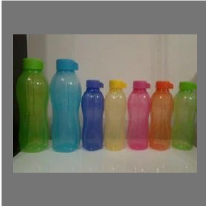
1 Litter Drinking Water Bottle Mould