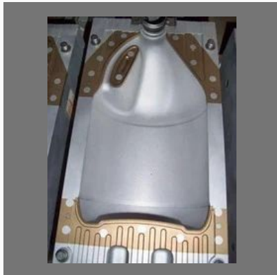
Blow Moulding Die 5 litter