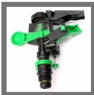
Agro Spray Nozzles Die