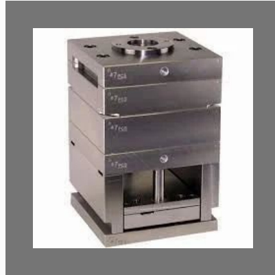
Plastic Injection Moulding Die