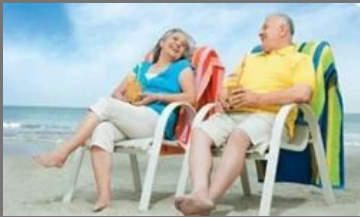
Guaranteed Lifetime Income Plan