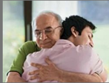
Whole Life Super Plan