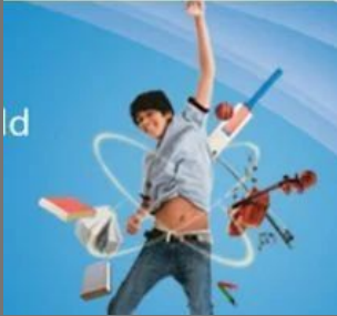
Life Insurance Policies