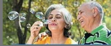
Forever Young Pension Plan