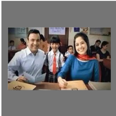
Childrens Future Planning