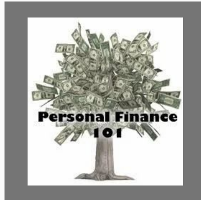
Financial Road Map And Goals