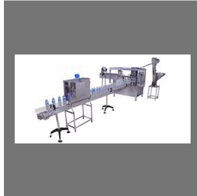
Mineral Water Bottle Packaging Machines