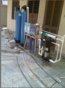
Mineral Water Plant 2000 Lph