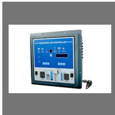
RO Control Panel