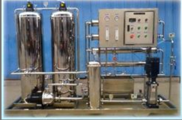
Mineral Water Plant (Stainless Steel)