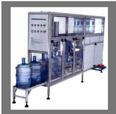
Mineral Water Jar Filling Machine