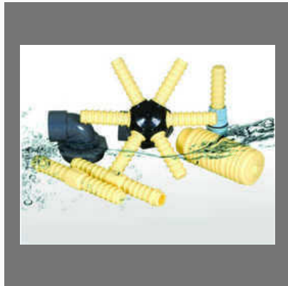
Distribution system for water treatment plant