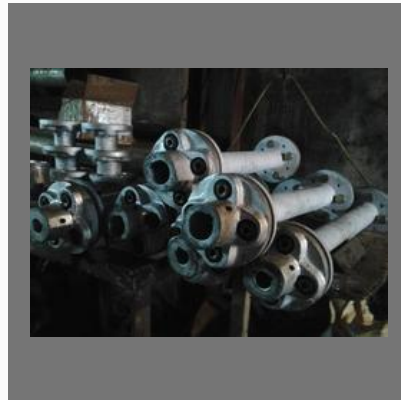
Drive Shaft For Cooling Tower