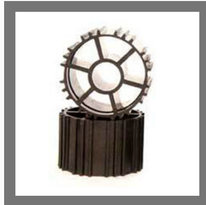
Bio Pac Media