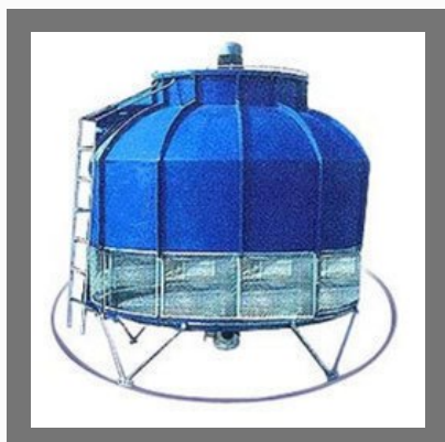
Round FRP cooling towers