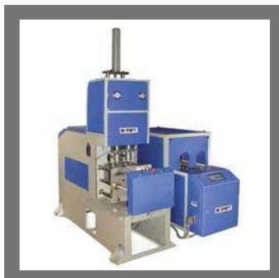
Blow Moulding Machine