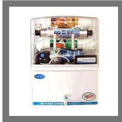
Domestic RO plants