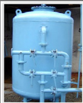
Iron Removal Filter