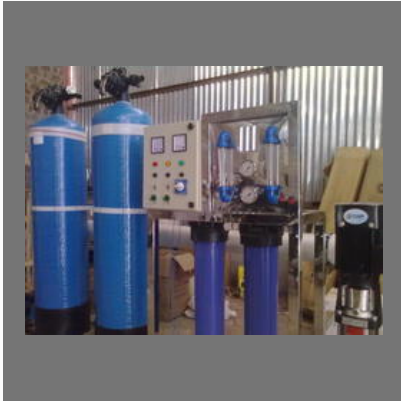
RO Plant 2000 lph