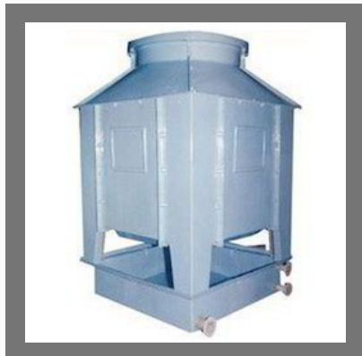
Square FRP Cooling Towers (Single Cell)