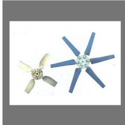
Cooling Tower Fan