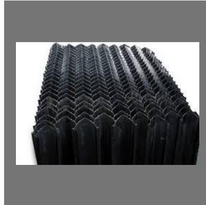
Tube Settler Media