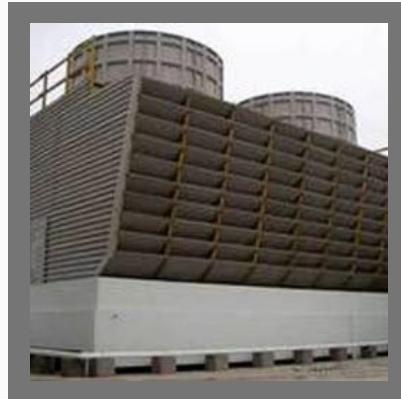
Wooden Cooling Towers