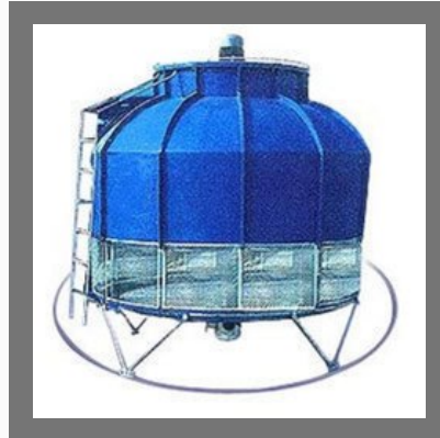
Round FRP cooling towers