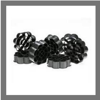
Fill Pac Media