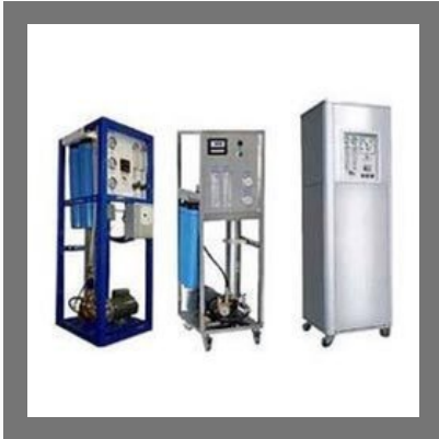
Package RO plants