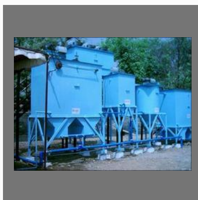
Effluent Treatment Plants