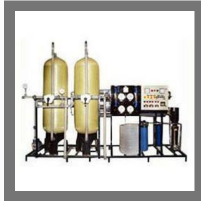
Industrial RO plant