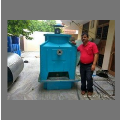
FRP SQUIRE COOLING TOWER