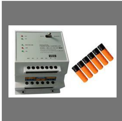
Water Level Controllers