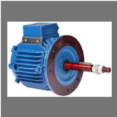
Cooling Tower Motor