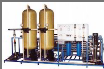
Industrial Reverse Osmosis Filtration Plant