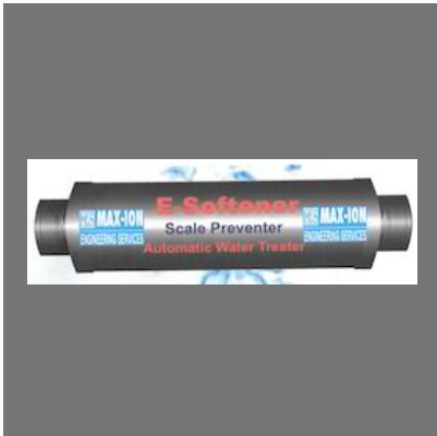
Softner Non Chemical