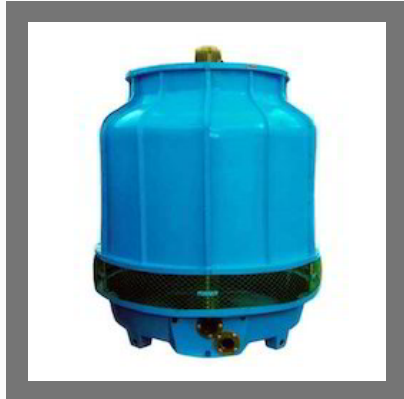
Round FRP Cooling Tower 15-20 TR