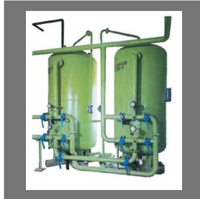
Multigrade Sand Filter