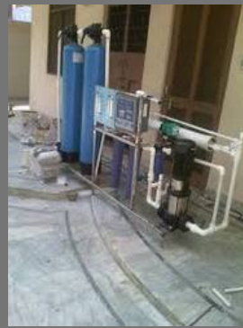
Mineral Water Plant (SS/FRP)