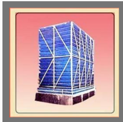
Fanless Cooling Towers