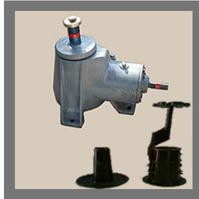
Cooling Towers Gear Box