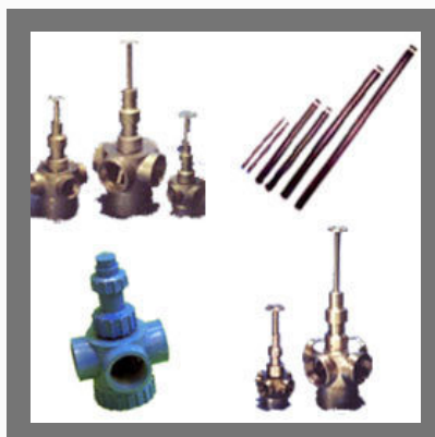
Cooling Towers Sprinkler /Water Distribution Systems