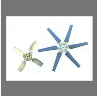
Cooling Tower Fan