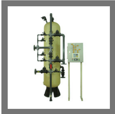
Mix Bed Plants