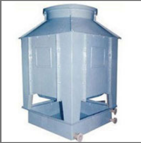
Cooling Tower Product Catalogue