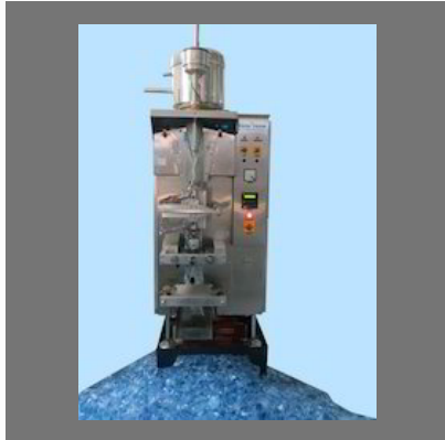
Mineral Water Pouch Packaging Machines