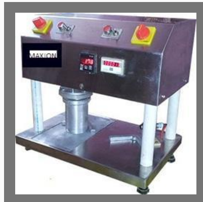
Water Glass Packing Machine