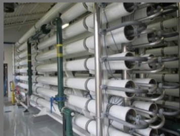
RO Membrane Pressure Tubes