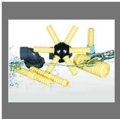
Distribution system for water treatment plant