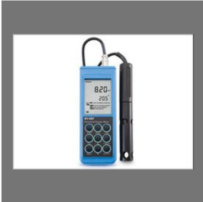
Automatic Dissolve Oxygen Cum Monitor Device