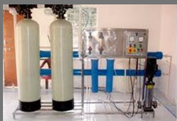
Mineral Water RO Plant