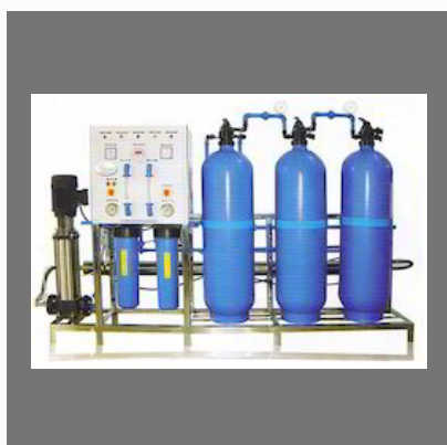
Reverse Osmosis Plant