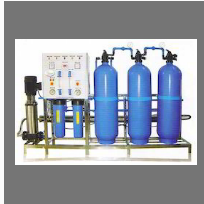
Reverse Osmosis Plant