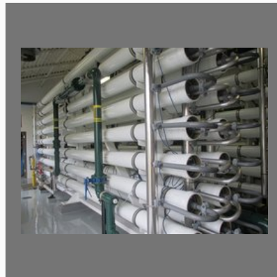
RO Membrane Pressure Tubes