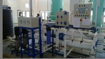
Industrial Mineral Water Plant