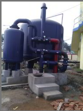
Iron Removal Filter