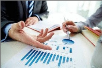
Corporate Finance Advisory