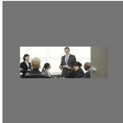
V.A.T./ Profession Tax Matters