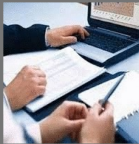
Service Tax Matters