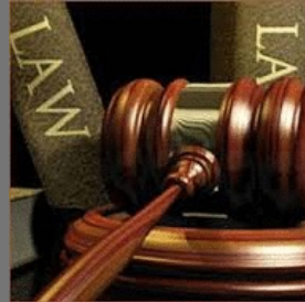
Company Law Matters