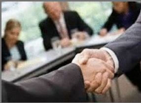
Project Financing and Structured Financial Services