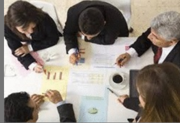
International Finance Related Services