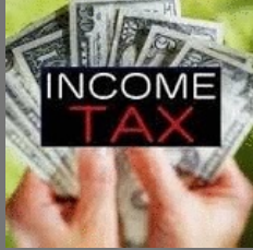
Income Tax Matters