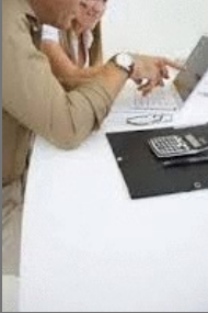
Certification of Financial Data / Statements