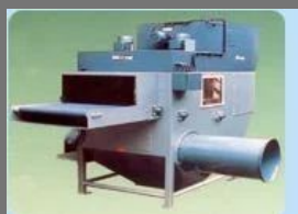
Automatic Bag Slitting Machine