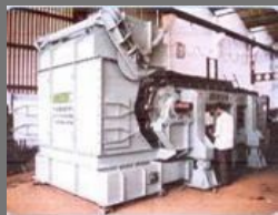
Apron Feeders Conveyors