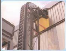
Sidewall Conveyor Belt System