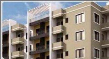
Flat Real Estate Services