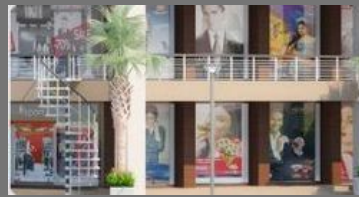
Shop Real Estate Services