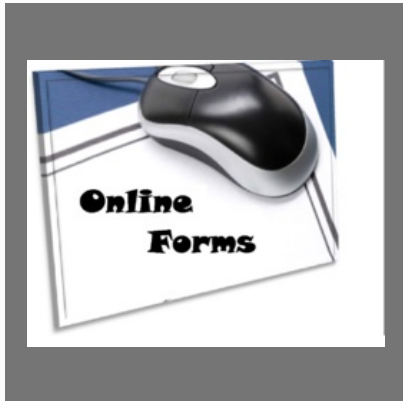
Customized Software Solutions