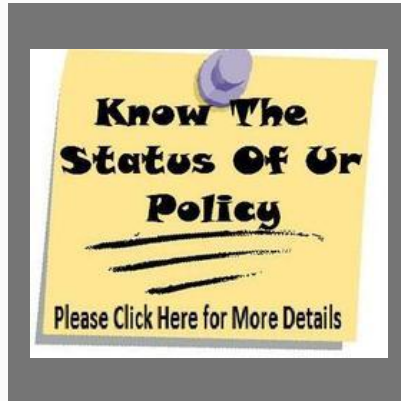
New Policies Life Insurance