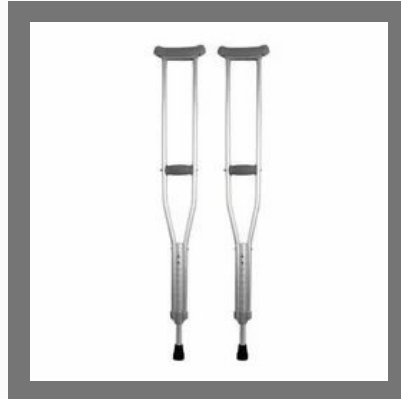
Handicap Underarm Crutches Support Stick