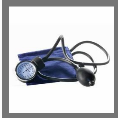
Manual BP Machine