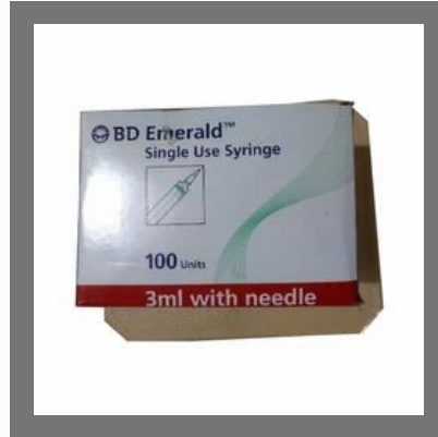
BD Emerald Syringe