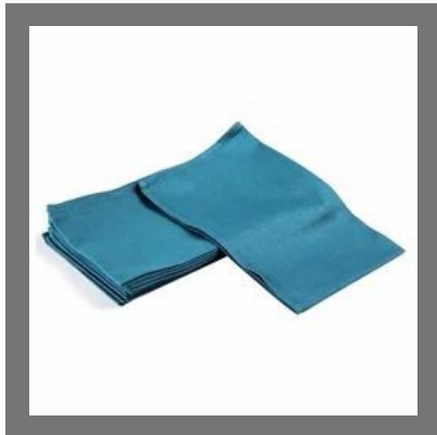
Hospital Plain Bed Sheet