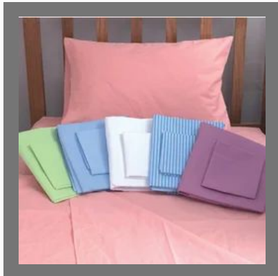
HOSPITAL BED SHEET LINEN