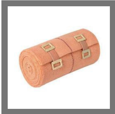
Cotton Crepe Bandage