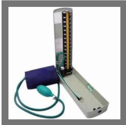
Mercury BP Machine