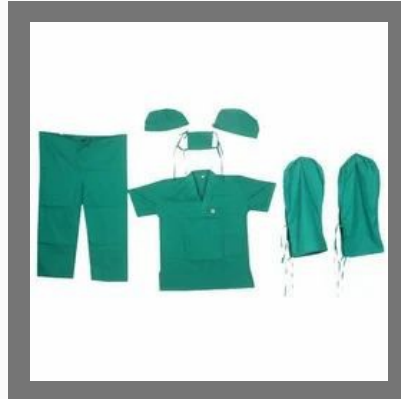
Hospital Uniform Set