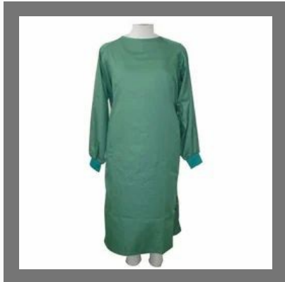
Hospital Doctor Gown