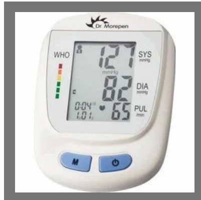
Dr Morepen Digital BP Machine