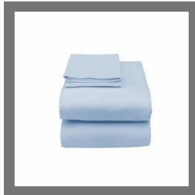
Hospital Bed Sheet