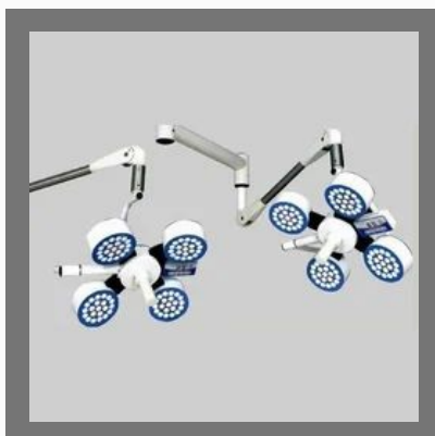
LED OT Light