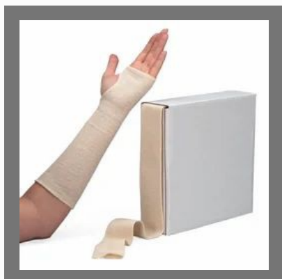
100% Cotton Stockinette