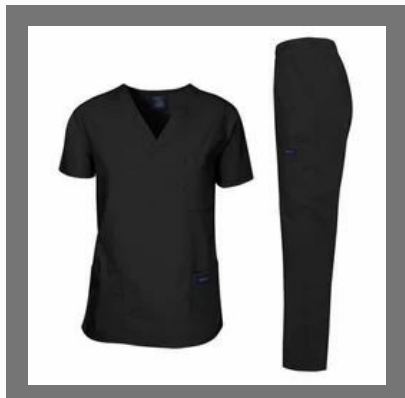
Medical Scrub Uniform Set