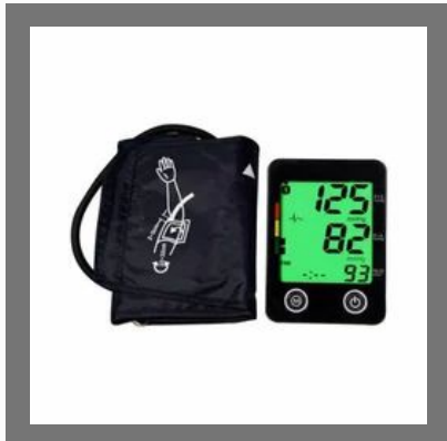
Digital BP Machine