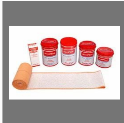
ELASTIC ADHESIVE BANDAGE