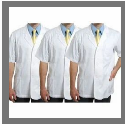
Hospital Doctor Coat