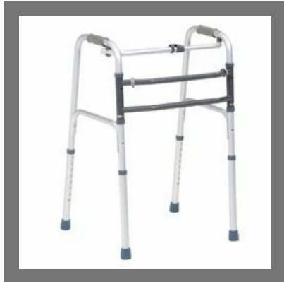
Handicap Adult Walker