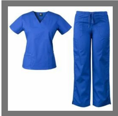
Blue Medical Scrubs Uniform Set