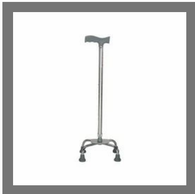
Handicap Tripod Support Stick