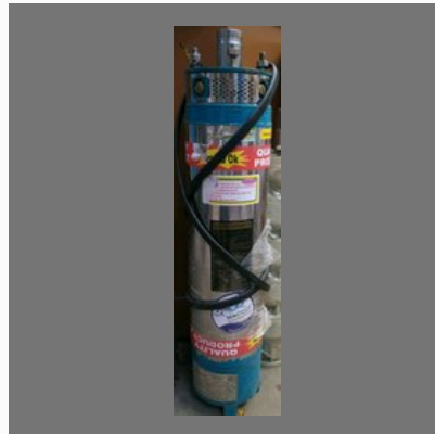
Positive Displacement Pump