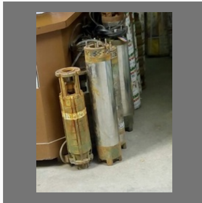
Centrifugal Pumps Parts