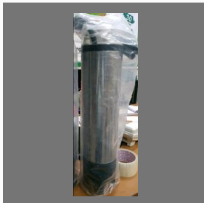
Electric Water Pump