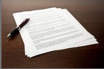
Notice Of Claim