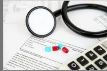
Pre & Post Hospitalization Expenses