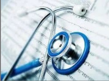
Health Care Services