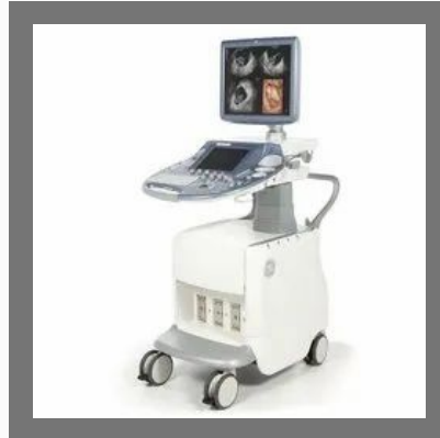
GE 3D Ultrasound Machine