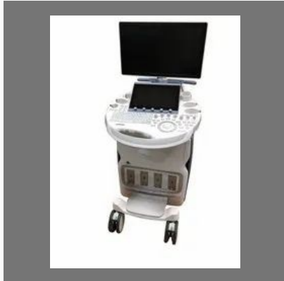
GE Voluson E10 Ultrasound Scan Machine