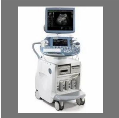
Ge Voluson E8 Ultrasound Machine