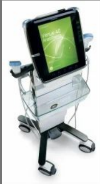
Refurbished GE Venue 40 Ultrasound Machine