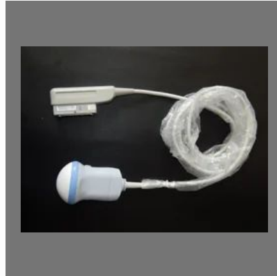
Repair of 4D Ultrasound Probe