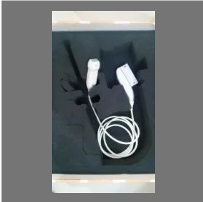
Ge Probes Sales And Service