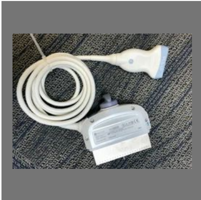
Ultrasound Probe 4C-D