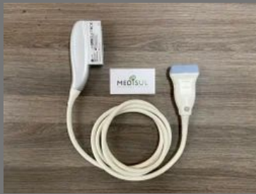
GE 12 L RS