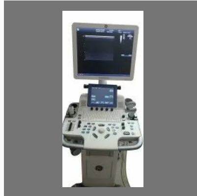
Pre Owned GE Vivid T8 Ultrasound Scan Machine