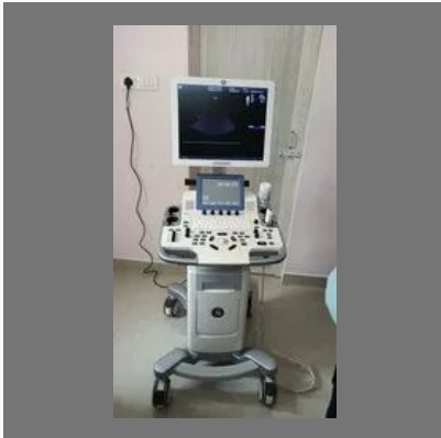
Ge Healthcare Vivid T8 Ultrasound System