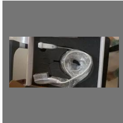
GE 3SC RS