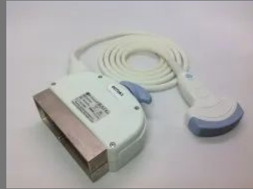
GE-4C-RS Convex Probe