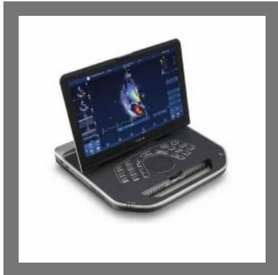
Refurbished GE Vivid Iq Ultrasound Machine