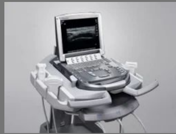
Sonosite 2D Echo Sonography Machine