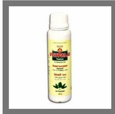
Vetpalai Thailam psoriasis oil