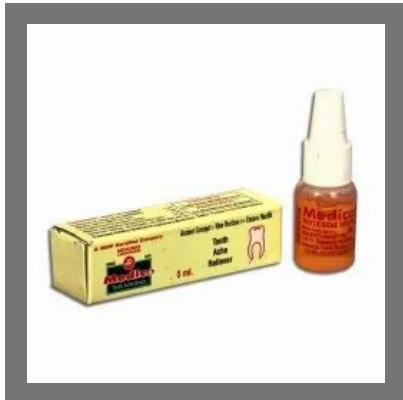
Medico Tooth Ache Relieve Drops