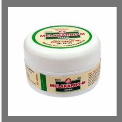
Melakarbo M Cream