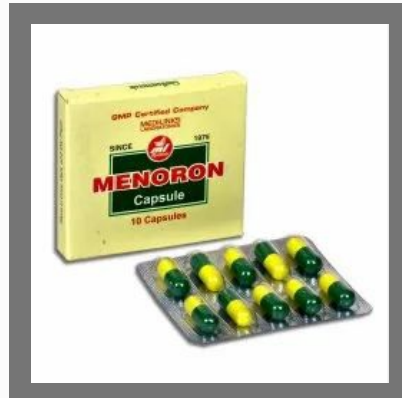
Menoron Herbal Capsule