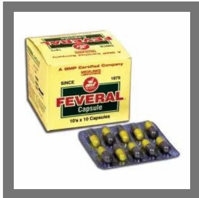
Feveral Herbal Capsule