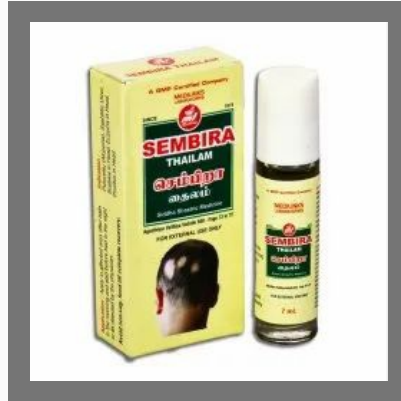
Sembira Thailam Oil