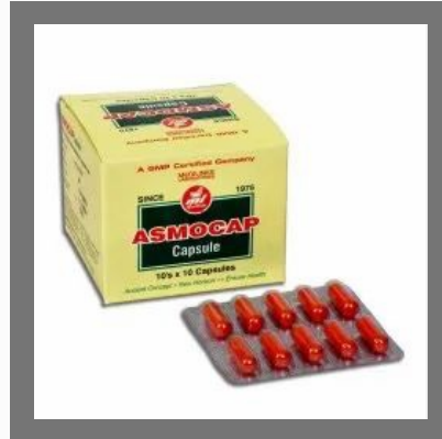
Asmocap Herbal Capsule