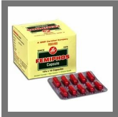
Femiphos Herbal Capsule