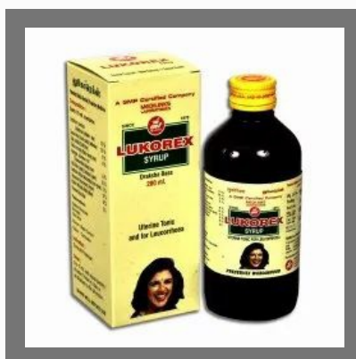
Lukorex Uterine Syrup