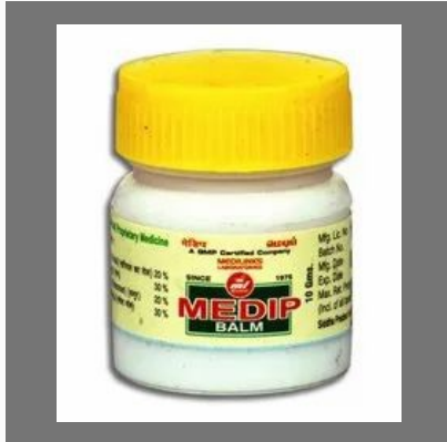
Medip Pain Reliever Balm