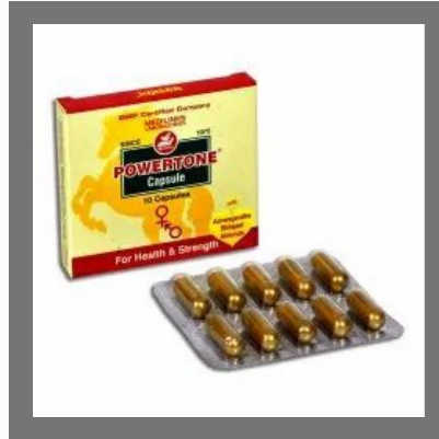
Powertone Health Capsule