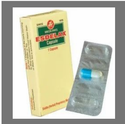
Esdelax Herbal Capsule