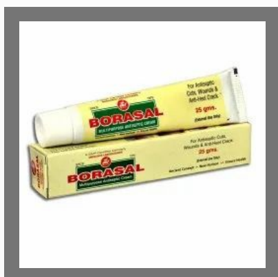
Borsal Multipurpose Antiseptic Cream