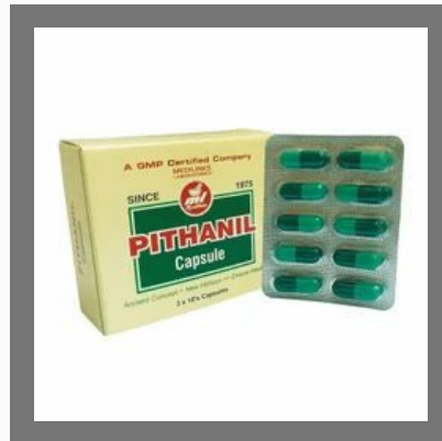
Pithanil Herbal Capsule