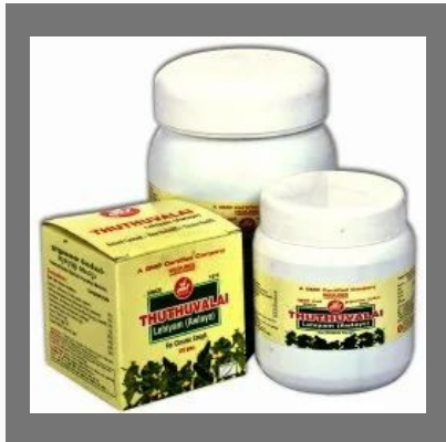
Thuthuvalai Lehiyam (Awalye)