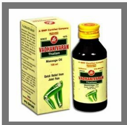
Vadhanivaran Thailam Massage Oil