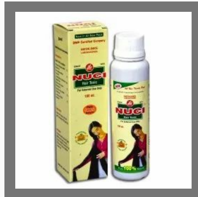
Nuci Hair Tonic