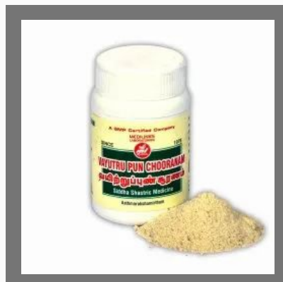
Vayutru Pun Chooranam