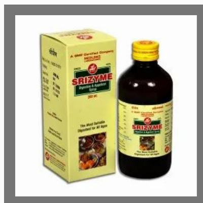
Srizyme Digestive And Appetizer Syrup