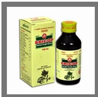
Sricof Herbal Cough Syrup