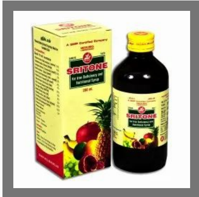
Sritone Iron Deficiency Syrup