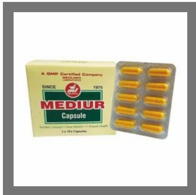
Mediur Herbal Capsule