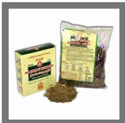
Nilavempu Kudineer Powder