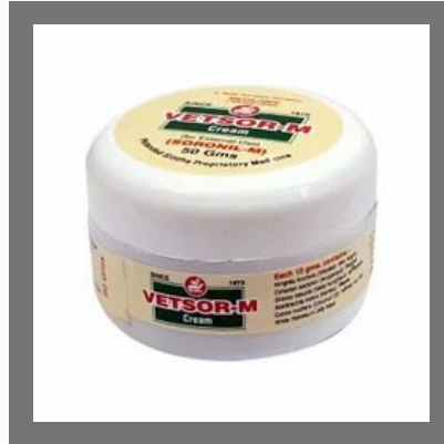
Vetsor- M Cream