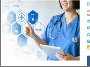
Orthopaedist Treatment Service