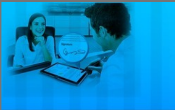
Financial Services for Banks & Financial Institutions