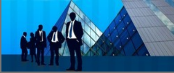
Financial Services for Corporate