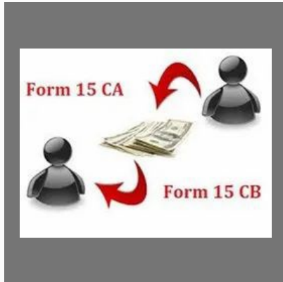
15CA 15CB Certificate