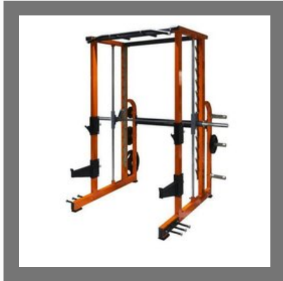
Counter Balanced Smith Machine