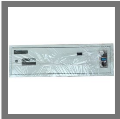
Automatic Sanitary Napkin Vending Machine