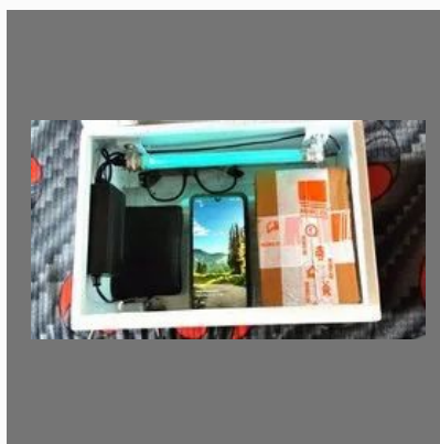
UV Disinfection Chamber