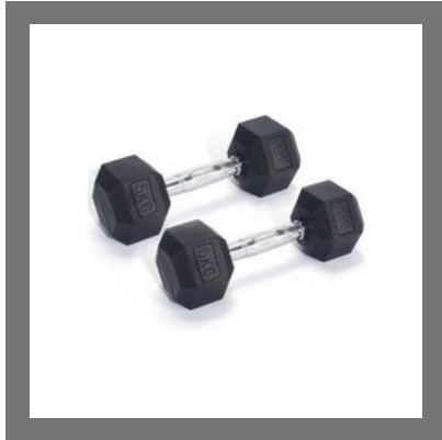
5Kg Hex Dumbbell