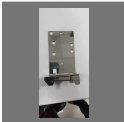
Sheet Metal Products