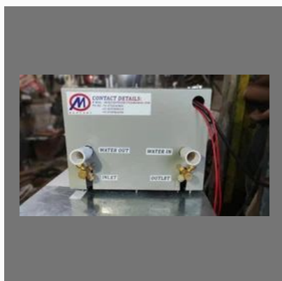
Online Water Chiller