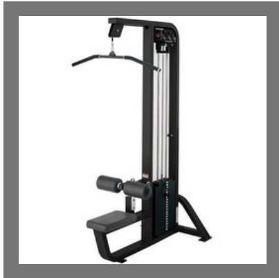
Hammer Strength Lat Pulldown Machine