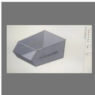
Sheet Metal Design