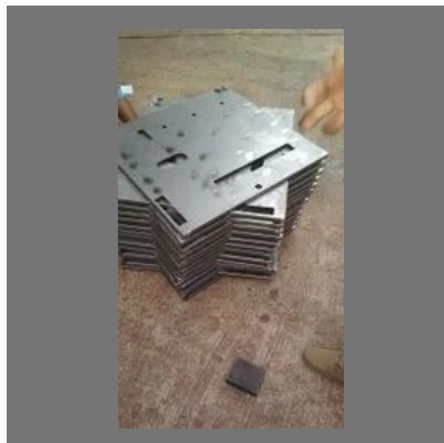
Laser Cut Sheet Metal Fabrication