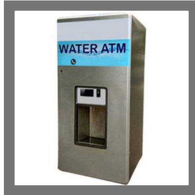
Automatic Water ATM