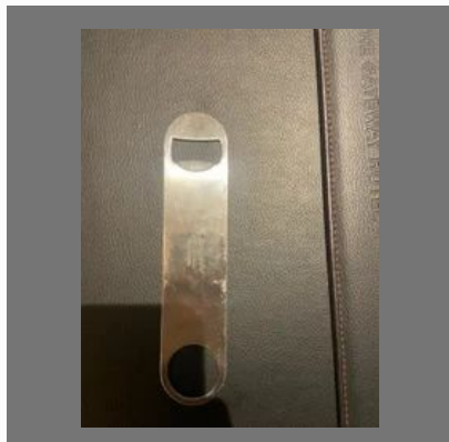
Sheet Metal Clamps