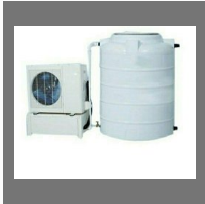
Water Chiller Plant