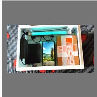
UV Disinfection Chamber