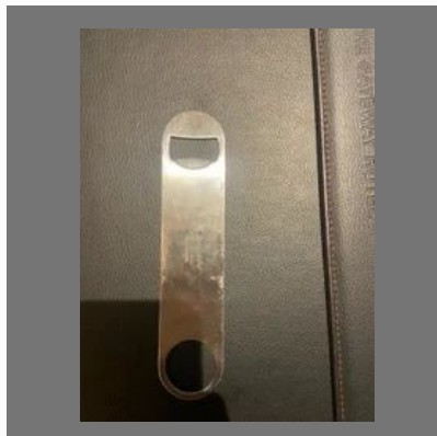
Sheet Metal Press Clamp