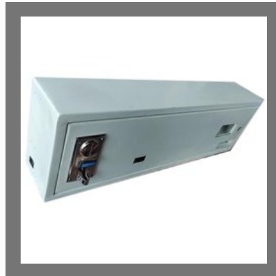
Manual Napkin Vending Machine