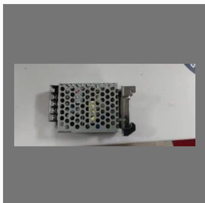
Laser Cutting Fabrication Service