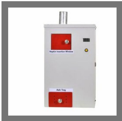
Sanitary Napkin Incinerator