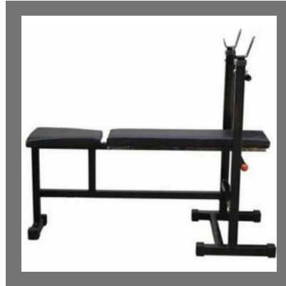
Weight Lifting Multipurpose Fitness Bench