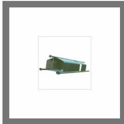
Industrial Water Heater