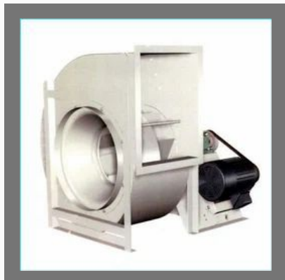
F D Fans