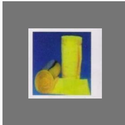
Bonded Fibre Glass Wool