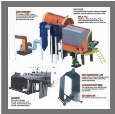
Boiler Water Wall