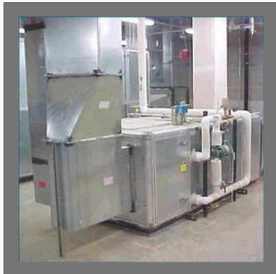
Heating & Air Conditioning System