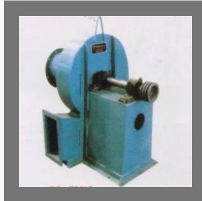
ID Fans and Industrial Blowers