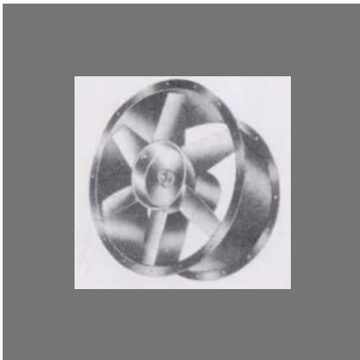
ID Fans and Industrial Blowers