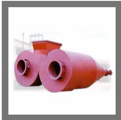
Pollution Control Equipment