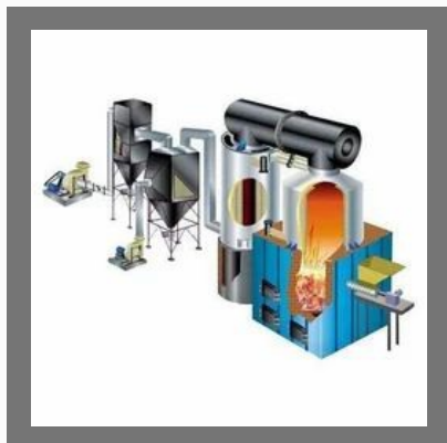
Thermic Fluid Heaters