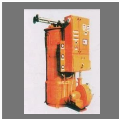
Thermic Fluid Heaters