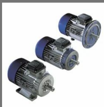
Standard Induction Motors