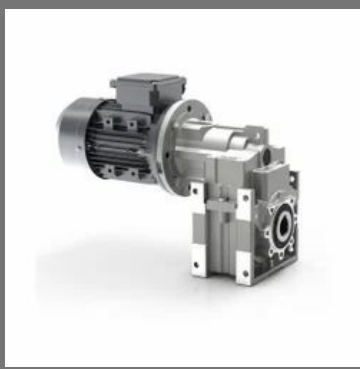
Parallel Shaft Helical Gearbox