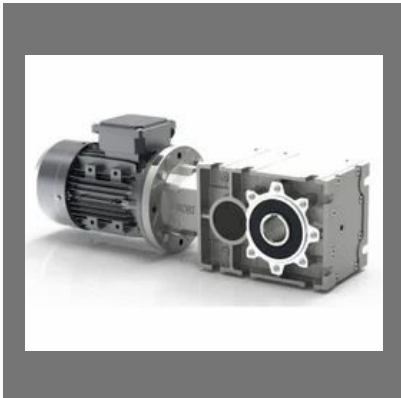
Bevel Helical Gearboxes