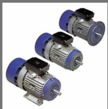
Three-Phase Asynchronous Brake Motor