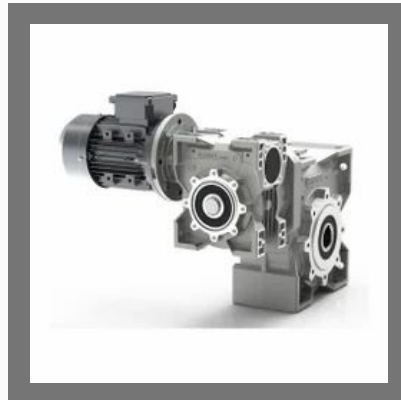
Double Worm Reduction Gear Box