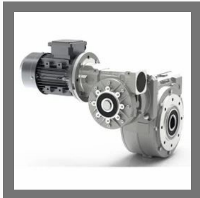
Two Stage Worm Gearbox RS/RS