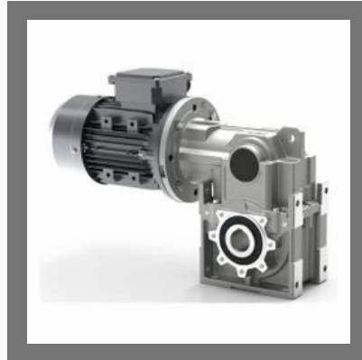
Bevel Helical Gearboxes