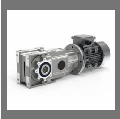
Bevel Helical Gearboxes