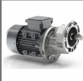
Single Stage Helical Gearbox