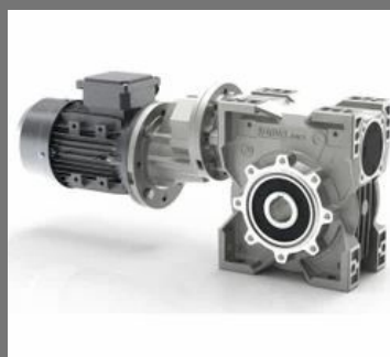
Heli Worm Geared Motor