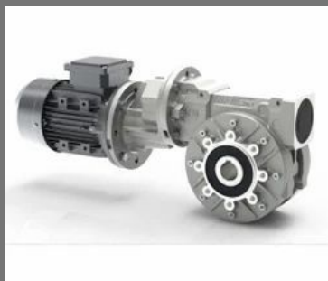
Heli Worm Gearbox