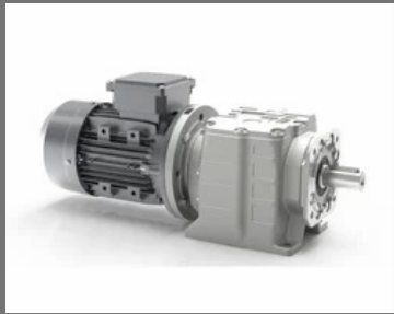
Three Stage & Two Stage Helical Gearbox