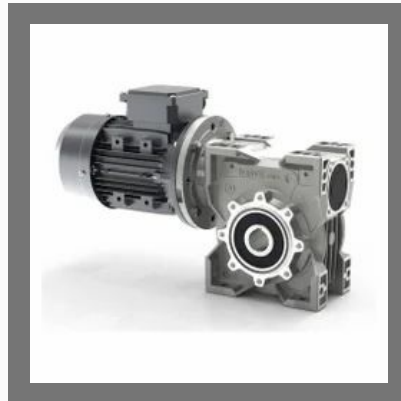
Worm Gearbox RT