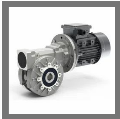
Worm Reduction Gearbox