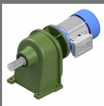
Three Stage & Two Stage Helical Gearboxes