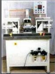
Heater Core Matrix Assembly Machine