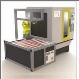
Process Automation Machines