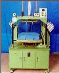
Head Lining Side Piercing Machine