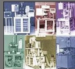
Automatic Assembly Machines