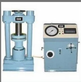
G - Lock Testing Machines