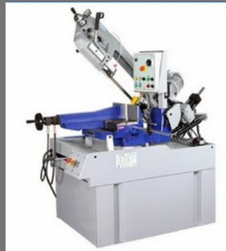
Metal Cutting Machines