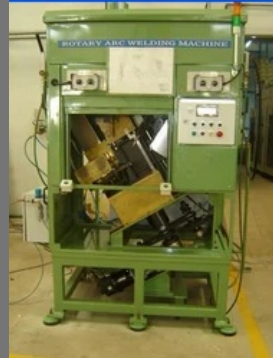
Welding Automation Machines