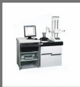
Test Measurement Machines