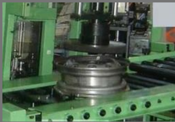
SPC - Statistical Process Control