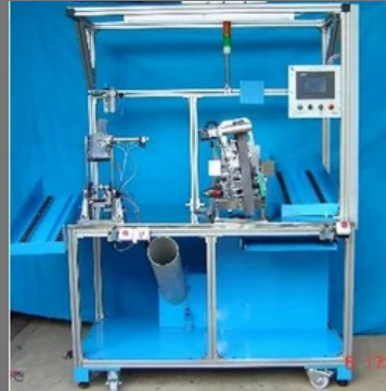
Seat Belt Tilt Lock Testing Machines