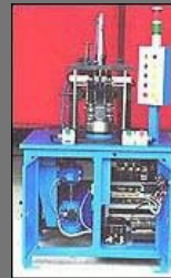
Seal Curling Machine