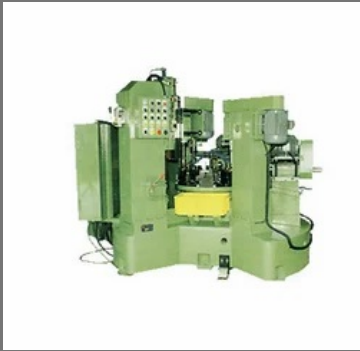
Special Purpose Machines