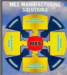
Manufacturing Execution System