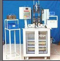
Piston and Seal Assembly Machine