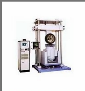
Pump Durability Testing Machines