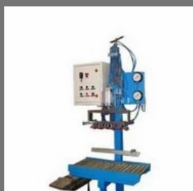
Air Leak Testing Machines