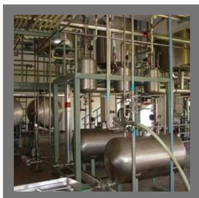
Herbal Extraction Plants