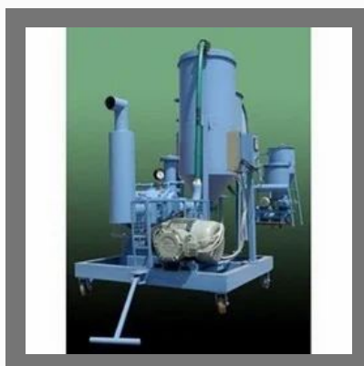
Pneumatic Conveying Systems