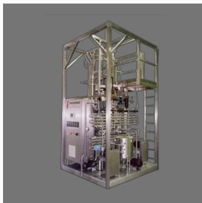
Spinning Cone Column