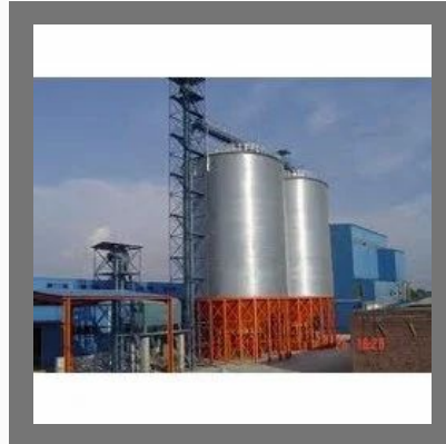
Corn Storage Silo