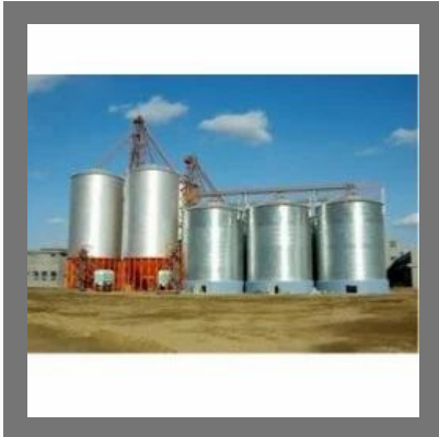
Grain Storage Silo