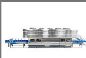
Hyperbaric Machine Model 135