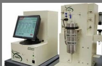
Supercritical Carbon Di Oxide Extraction Systems