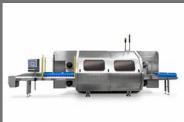
Hyperbaric Machine Model 55