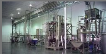
Integrated Extraction For Tea, Coffee And Beverages