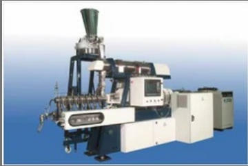
Twin Screw Extruder