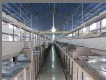
Solvent Extraction Plants