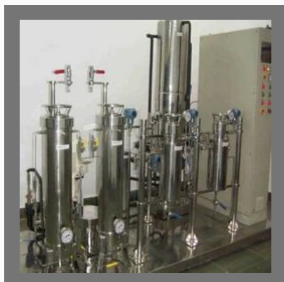
Supercritical Fluid CO2 Extraction Systems