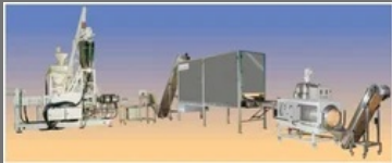
Production Line Machines For Breakfast Cereals