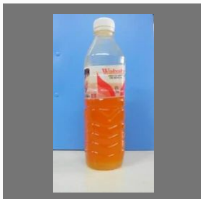
Wheat Germ Raw Oil