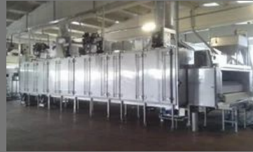
Complete Peanut Butter Line