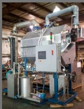
Solvent Recovery Systems