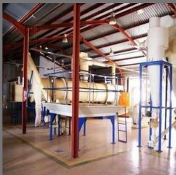
Oleoresin Extraction Plants