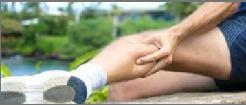
Sports Injuries Management