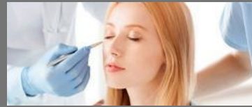
Dermatology And Laser Treatment