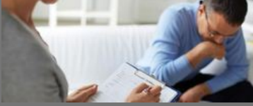
Psychology And Psychiatry