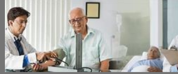
Preventive Health Checkups