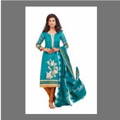
Ladies Printed Unstitched Suit