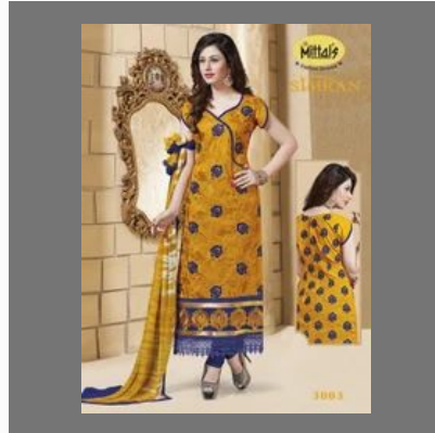
Unstitched Women Embroidered Suits