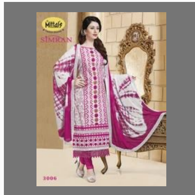
Unstitched Embroidered Suits for Ladies