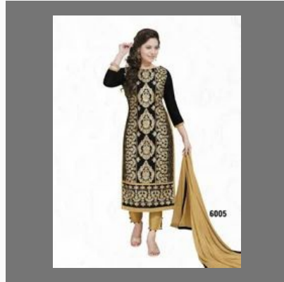
Ladies Unstitched Suits