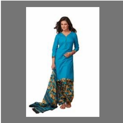
Fancy Printed Unstitched Suit