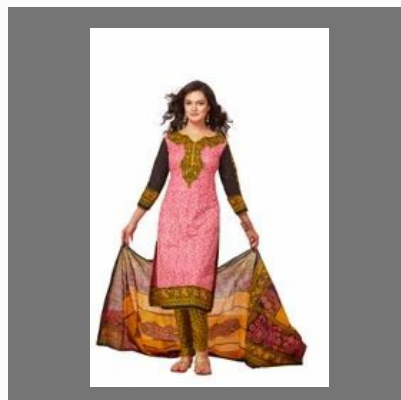
Ladies Printed Unstitched Suits