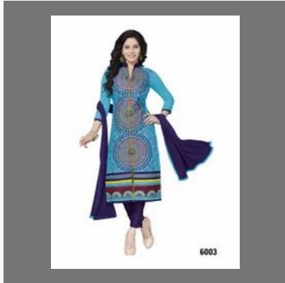
Designer Unstitched Suit