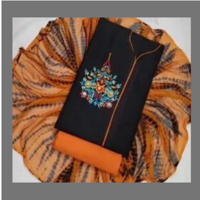
Unstitched Cotton Patiala Suit