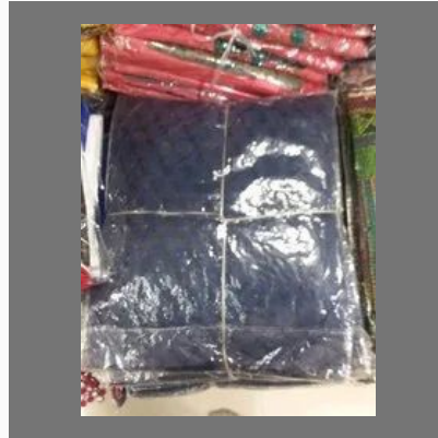
Women Dress Material