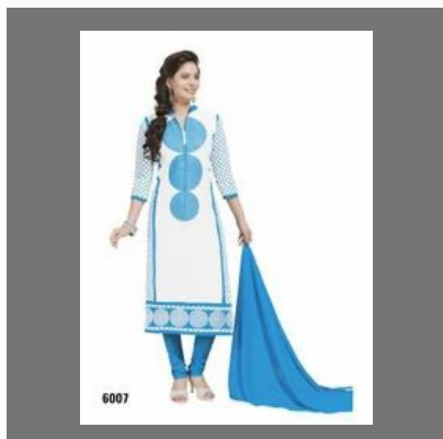
Womens Unstitched Suit