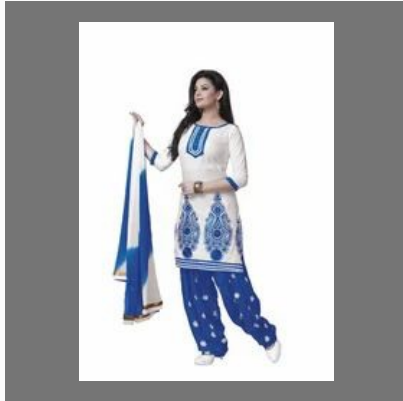
Blue Patiyala Salwar Suit Material