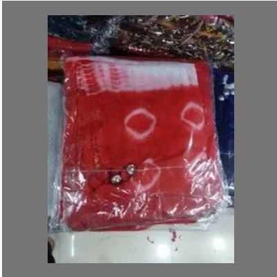
Designer Dress Material