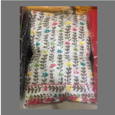
Ladies Dress Material