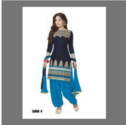
Navy Blue Ladies Unstitched Suits