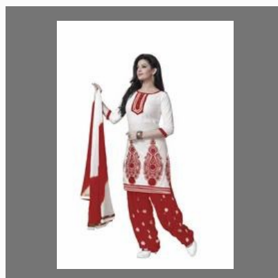
Patiyala Salwar Suits Material