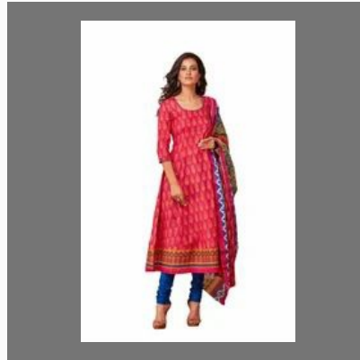
Printed Unstitched Suit