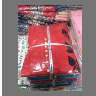
Cotton Dress Material