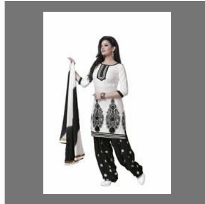
Black Patiyala Salwar Suit Material