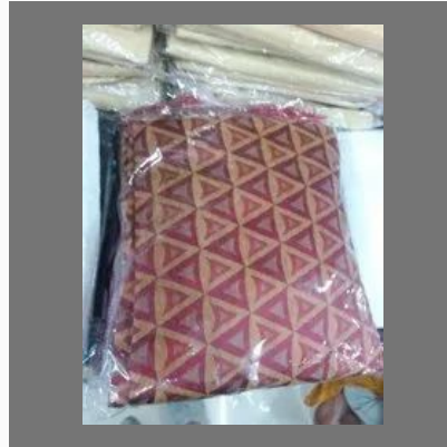
Printed Dress Material