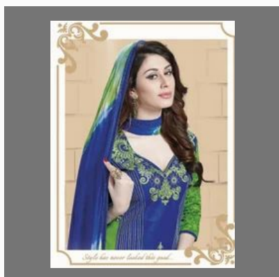
Unstitched Embroidery Suits