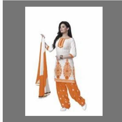
Yellow Patiyala Salwar Suit Material