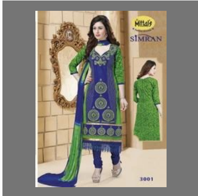
Unstitched Ladies Embroidery Suit