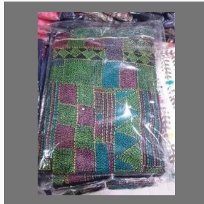
Ladies Cotton Dress Material