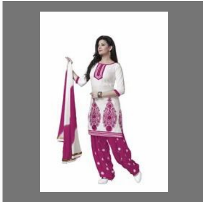
Designer Patiyala Salwar Suit Material