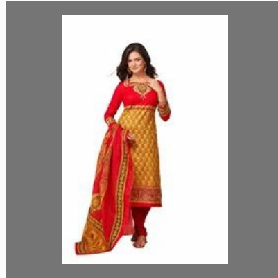
Designer Printed Unstitched Suit