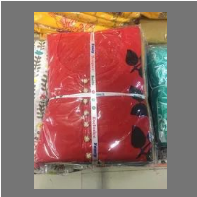
Ladies Fancy Dress Material