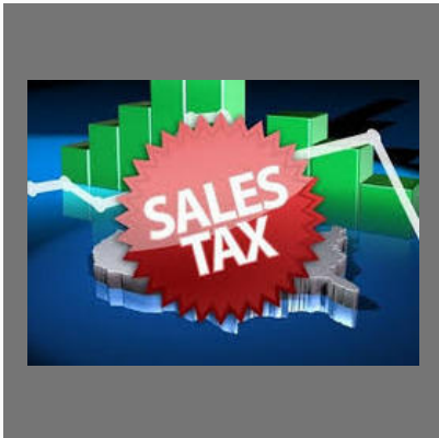
Sales Tax Service