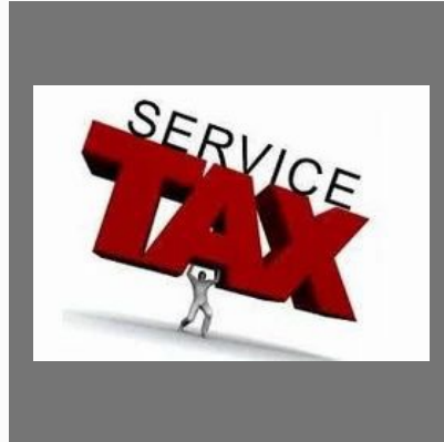
Service Tax Service