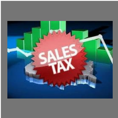
Sales Tax Service