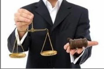
Corporate Laws Services