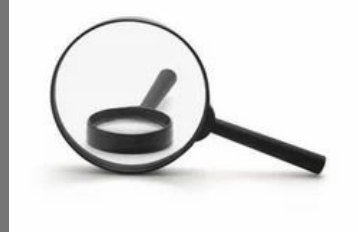
Special Investigative Audit