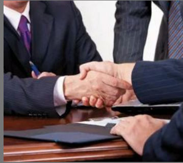
Project Consultancy & Finance