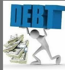
Debt Restructuring Service