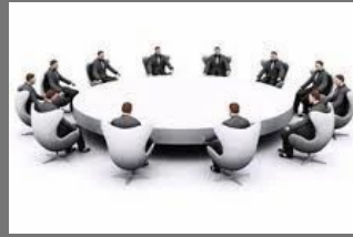
Corporate Restructuring Service