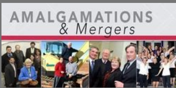
Mergers and Amalgamation