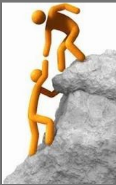
Joint Ventures / Collaborations