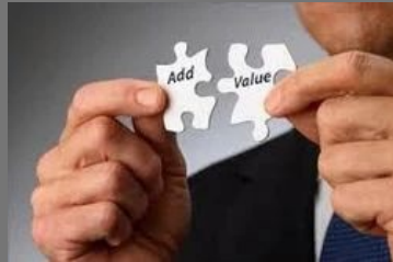
Valuation Of Business Enterprise