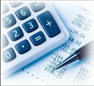
Concurrent Auditing Services