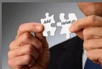
Valuation Of Business Enterprise