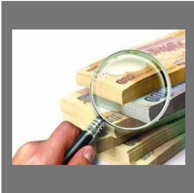
Indirect Tax Services