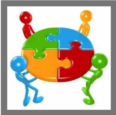
Preparation & Filing Of Tax Returns