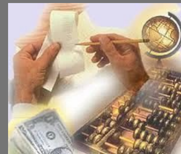
Compliance with IFRS