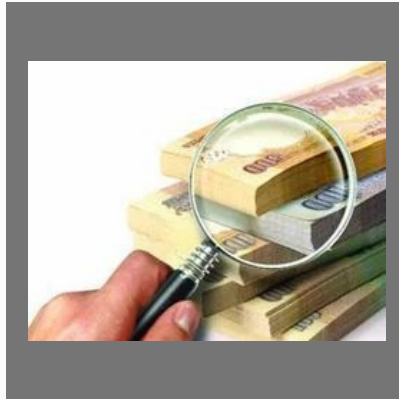
Indirect Tax Services