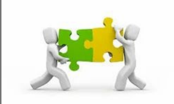
Mergers & Acquisition