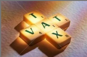
VAT Audit Service