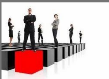
Setting Up Of Liaison Office & Branches In India/overceas