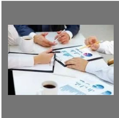
Portfolio Advisory Services