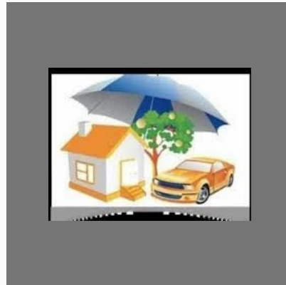
Life & Non-Life Insurance Services