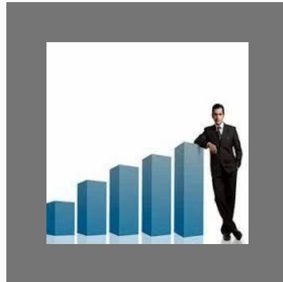
Wealth Management Services