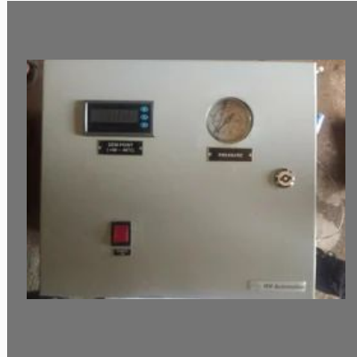
Dew Point Meter