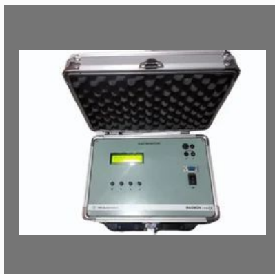
Fuel Efficiency Monitor