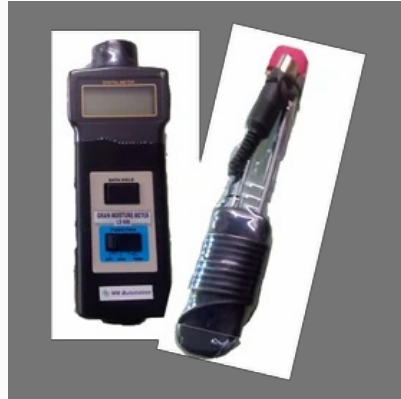
Portable Moisture Meter