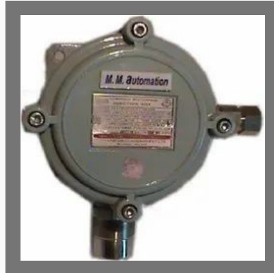
Gas Sensor Transmitters