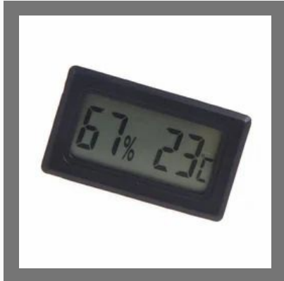
Humidity Indicating Meter