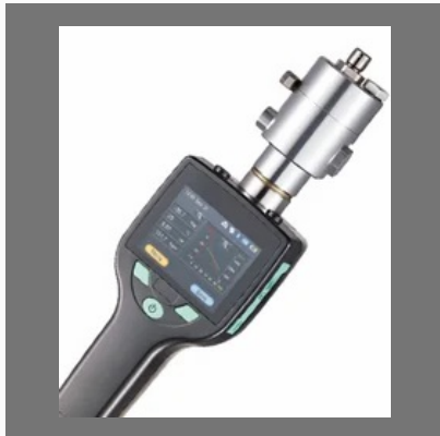
Portable Dew Point Meter