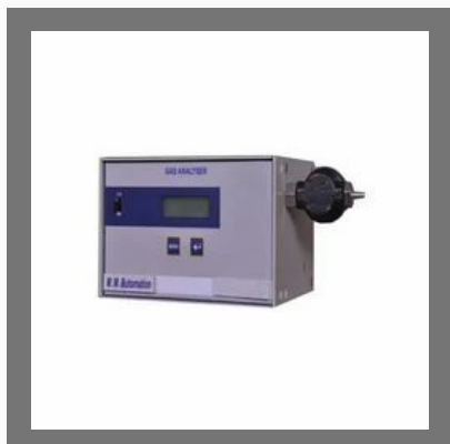
Portable Online Gas Analyser