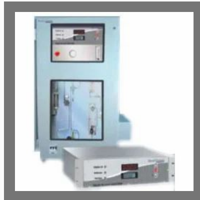
Online Oxygen Analyzer