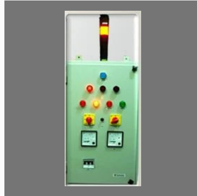
Pump System Start Up Panel