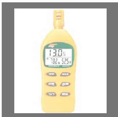
Digital Dew Point Meter