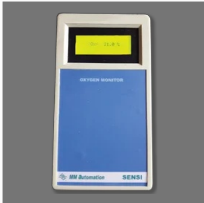
Confined space Oxygen Monitor