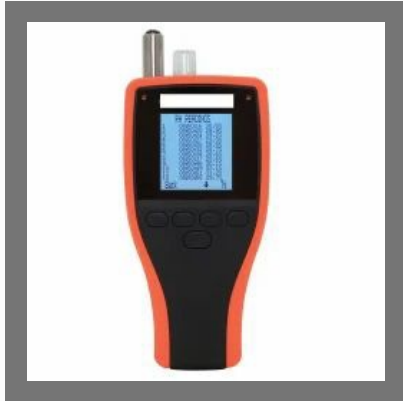
Precision RH Dew Point Meter