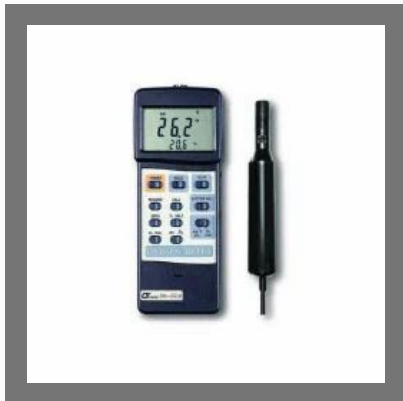
Portable Dissolve Oxygen Analyzer