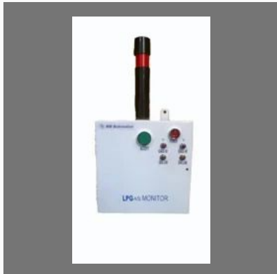
Gas Leakage Detector