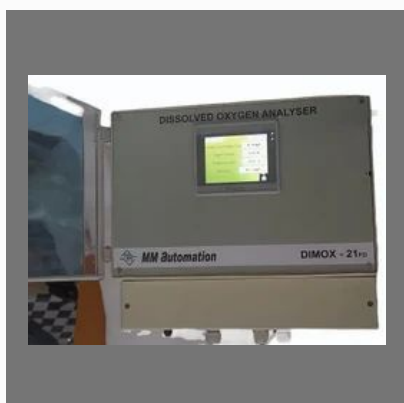
Dissolved Oxygen Meter