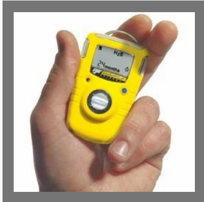
Hydrogen Gas Detector