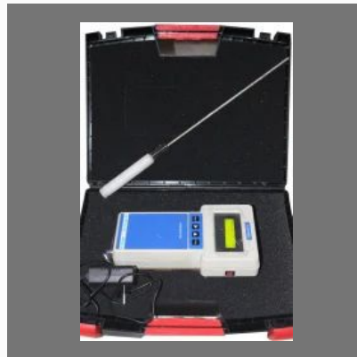
Portable Stack Gas Analyzer