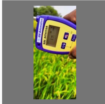
Combustible Gas Detector