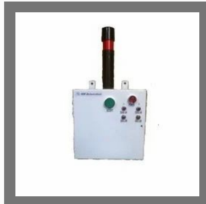
LPG Gas Detector