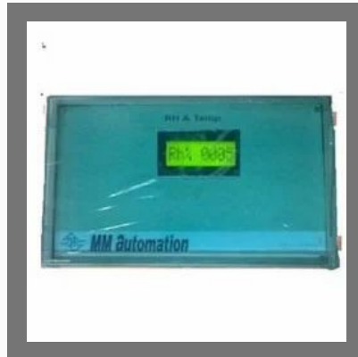
Fixed Dew Point Meter