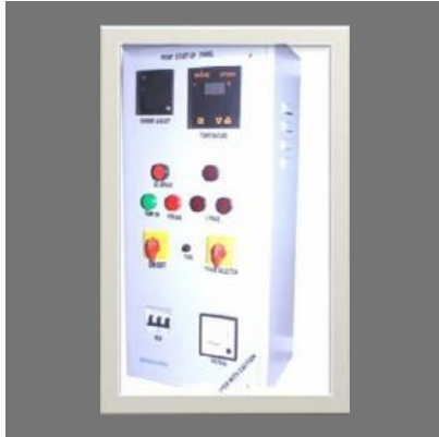
Automation Control Panel