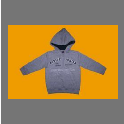
Hooded Kid's Wear