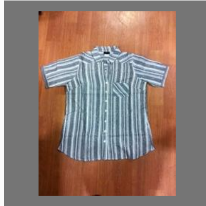
Fashion Top S13127