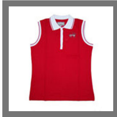
Designer Sleeveless Tops