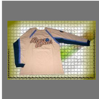
Knitted Boys Garments