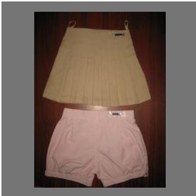
Ladies Skirt & Shorts