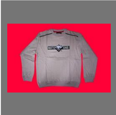
Mens Sweat Shirt