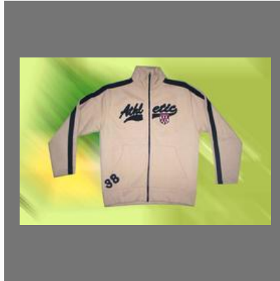
Knitted Boys Garments