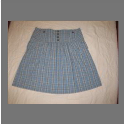
Kid's Woven Skirt