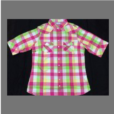
Yarn Dyed Checked Shirt