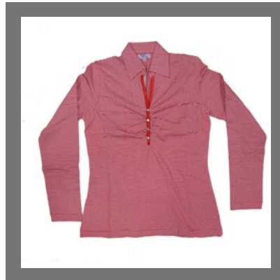
Ladies Wear Tops