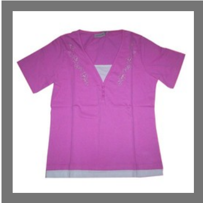
Designer Fashion Tops