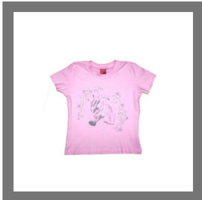
Girls Knitted Tops