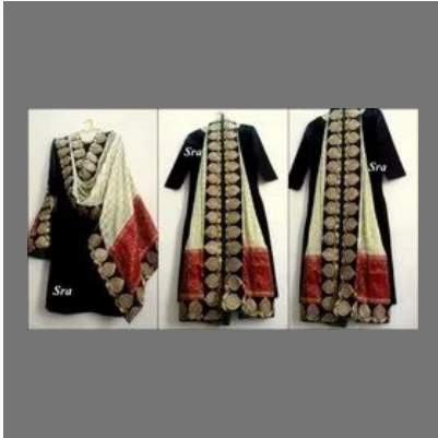
Designer Brocade Dupatta