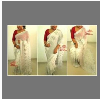
White Designer Saree