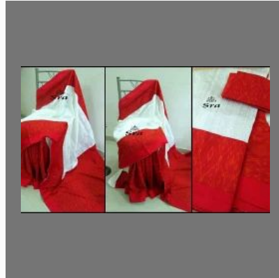
Bengali Style Saree