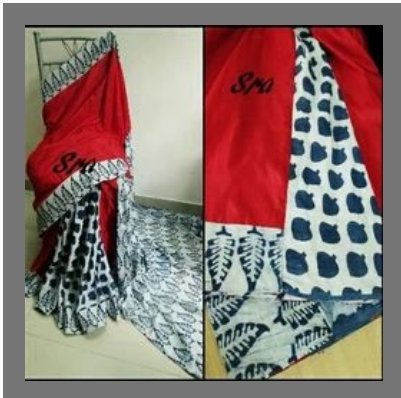
Indigo Print Silk Saree