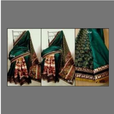
Gorgeous Kalamkari Saree