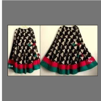
Vibrant Flared Skirt