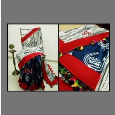
Indigo Shibori Print Saree