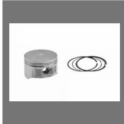
Two Wheeler Piston