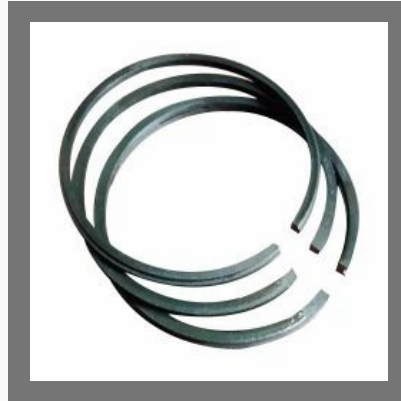
Cast Iron Air Compressor 63.5mm Piston Rings