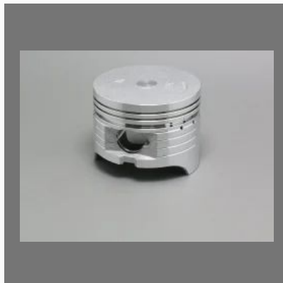
Hero Super Splendor Piston