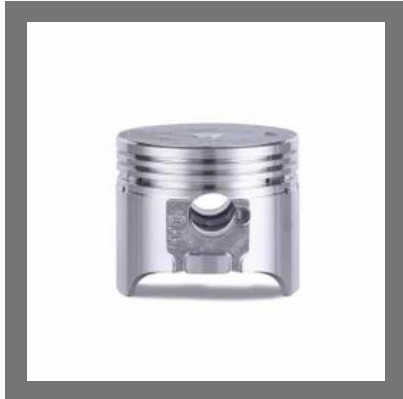
Motorcycle Engine Piston