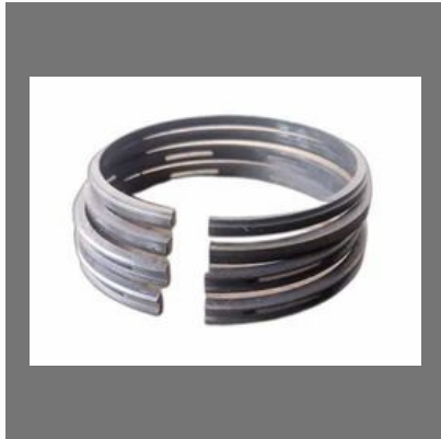
Elgi Air Compressor Piston Ring