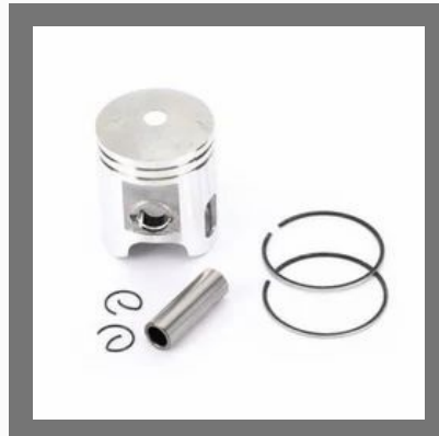
Bajaj Bravo 5 Port Piston Ring