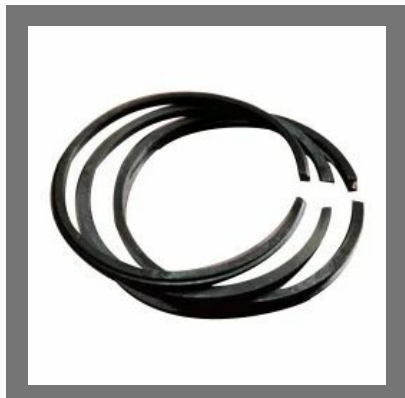
Cast Iron Air Compressor 57mm Piston Ring