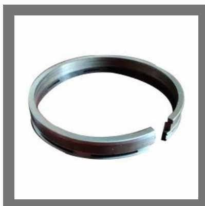
Cast Iron Diesel Piston Rings