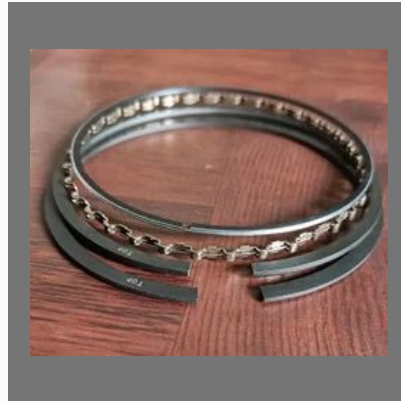
Ingersoll Rand Air Compressor Piston Ring