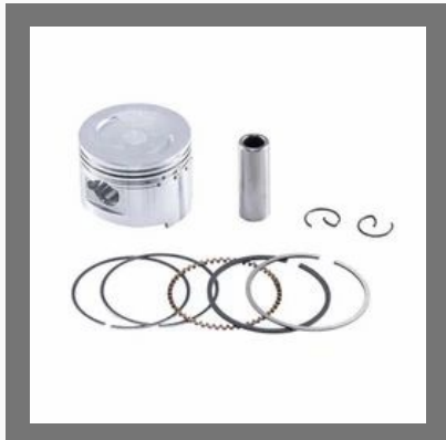
2 Wheeler Engine Piston Kit