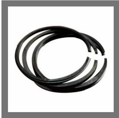
Cast Iron Air Compressor 68mm Piston Ring