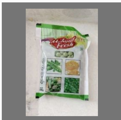
200g Frozen Green Peas