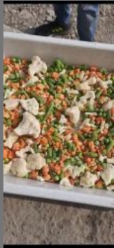
Frozen Mix Vegetable