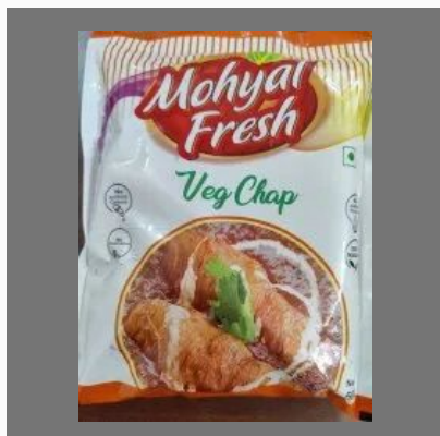
Frozen Veg Soya Chaap