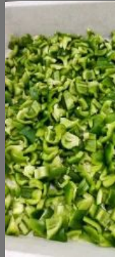
Frozen Green Capsicum