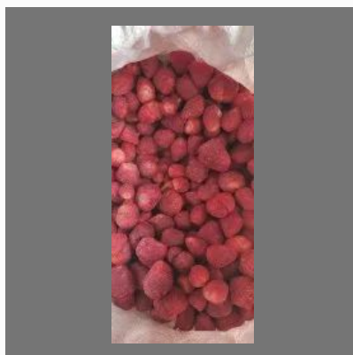
IQF Frozen Strawberry