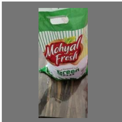
5kg Frozen Green Peas