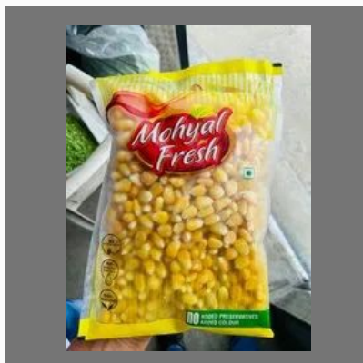
Frozen American Sweet Corns