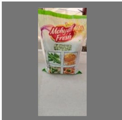
1kg Frozen Green Peas