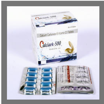
Pharma Franchise Company