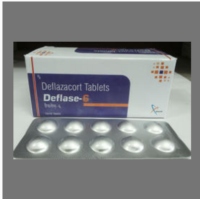
Pharma Franchise in Cuddalorei