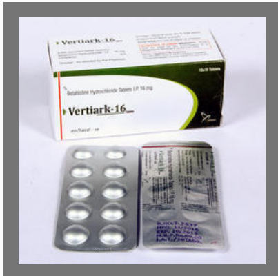
Betahistine Hcl Tablet