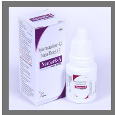
Chandigarh Based PCD Pharma Companies