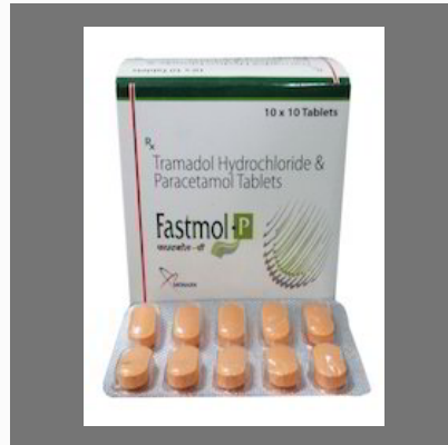
Pharma Franchise In Panna