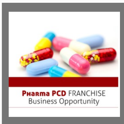
PCD Pharma Franchise