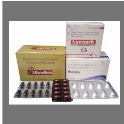
Pharma Franchise in Darrang