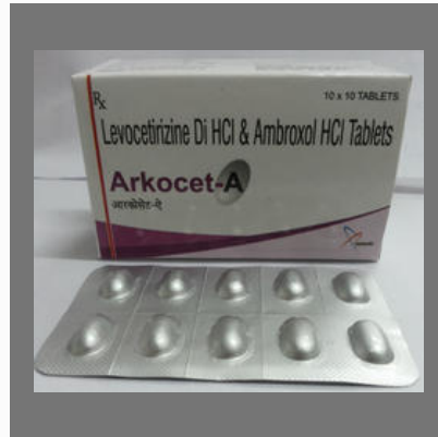
Pharma Franchise in Dharmapuri