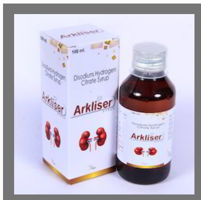
Pharmaceuticals Manufacturing Service