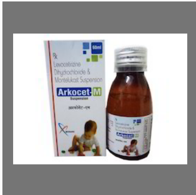
Pharma Franchise In Gwalior