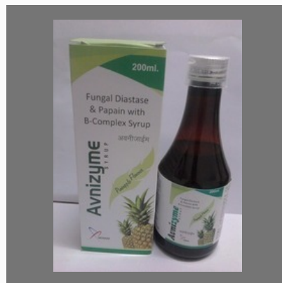
Third Party Manufacturing In Pharma