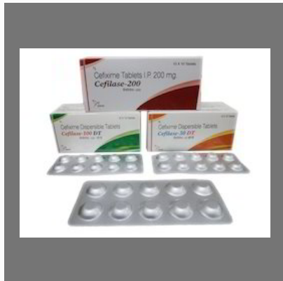
Pharma Franchise Manufacturer