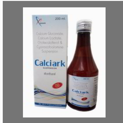
Pharma Franchise In Vidisha