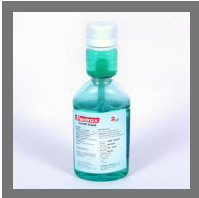
Pharmaceuticals PCD Franchise For Miscellaneous Products