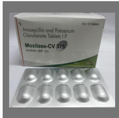
Pharma Franchise in Tiruchiorappalli