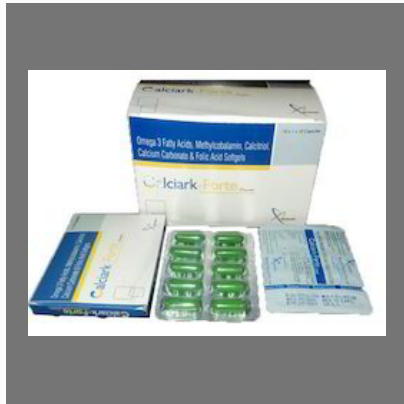
Pharmaceutical Manufacturing Companies