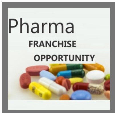
Ethical Pharma Franchise