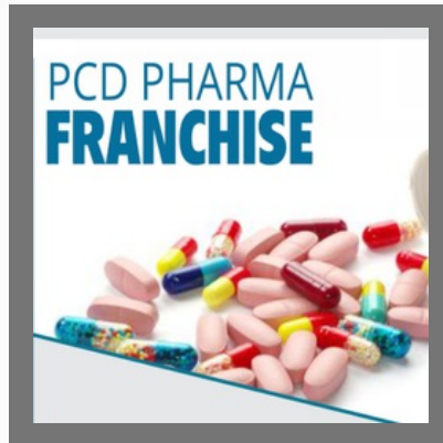
PCD Pharma Franchise Company In Chandigarh