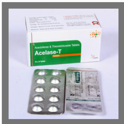
Contract manufacturing pharma