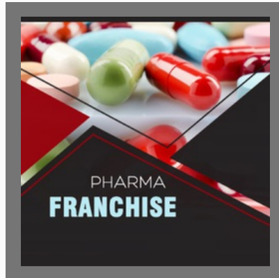
Pharma Franchise in Giridih