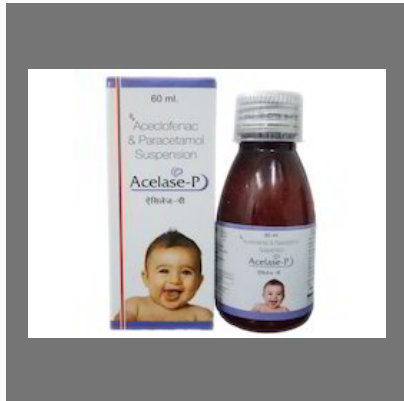
Indian Pharmaceutical Franchise