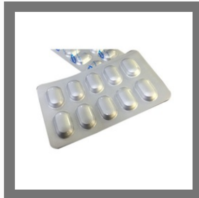
Cefilase OZ Tablets