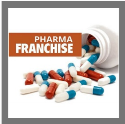
Pharma Franchise in Jorhat