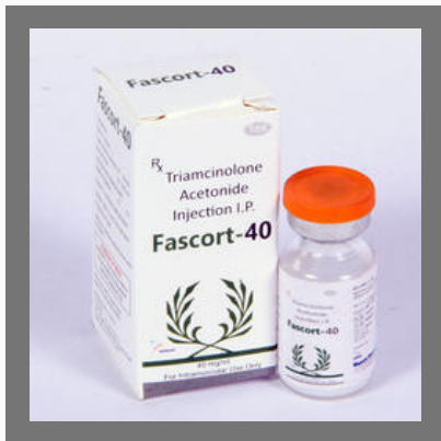
Pharmaceuticals PCD Franchise