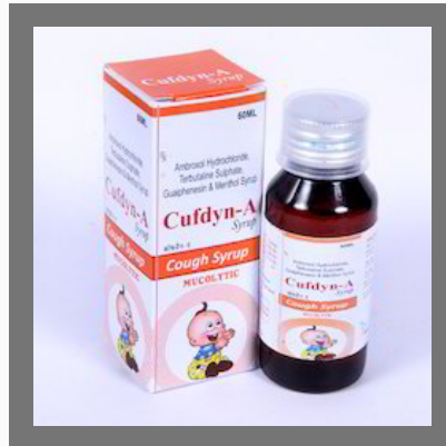
Pharma Franchise in Kerela