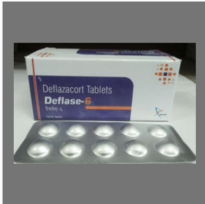
Pharma Franchise In Raisen