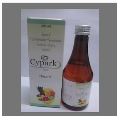
Pharma Franchise in Dibrugarh