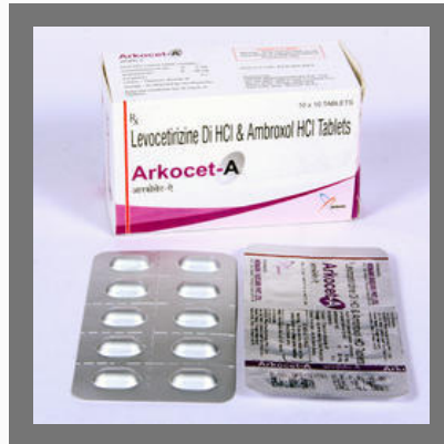
Monark Biocare Pharma Franchise