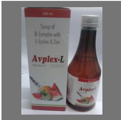
Pharma Franchise in Karimganj