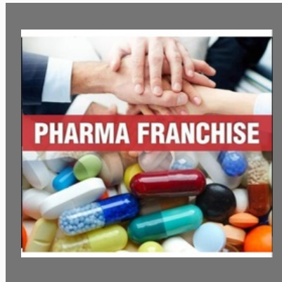
Generic Pharma Franchise Company