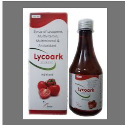
Pharma Franchise in Golaghat