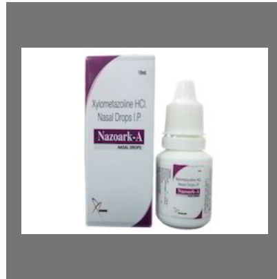
Pharmaceutical Contract Manufacturing Services