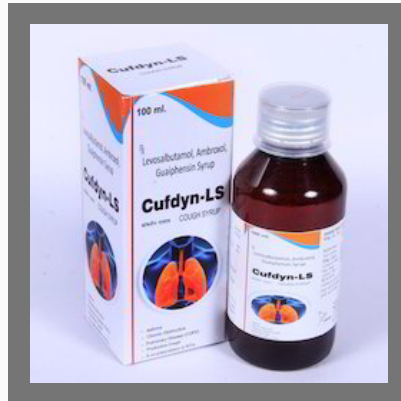
Pharma Franchise PCD