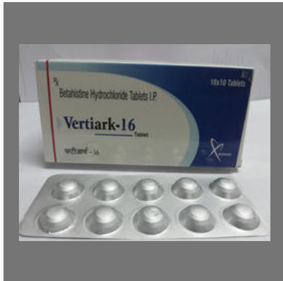
Betahistine HCL 16mg Tablet