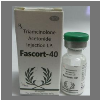
PCD Companies In Chandigarh