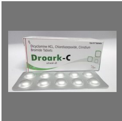
Pharma Franchise in Thoothkudi