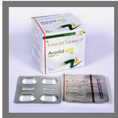
Linizolid 600mg Tablet