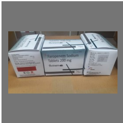
PCD Based Pharma Company