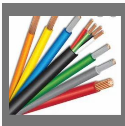
GXL, TXL, SXL Wires