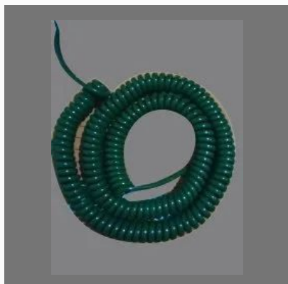
Polyurethane Spiral Cable