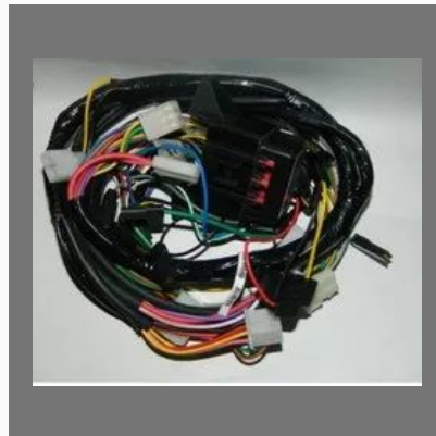
Ape Wiring Harness