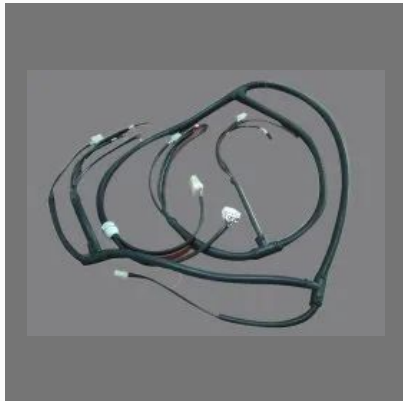
Generator Wiring Harness