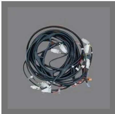
Electric Vehicles Wiring Harness