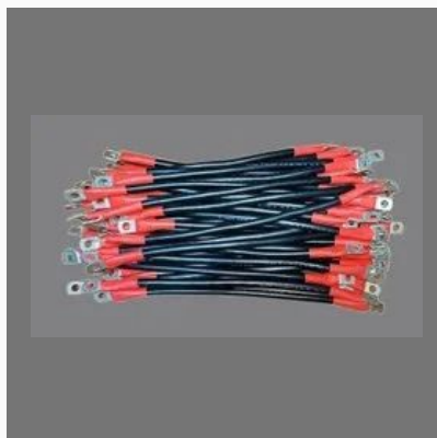
Battery Cable Assemblies