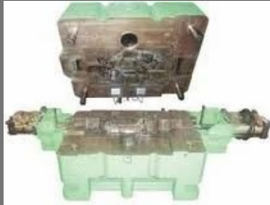
Pressure Die Casting Dies Hot Chamber