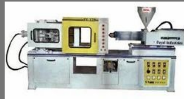
Horizontal Plastics Moulds