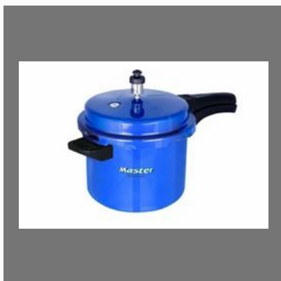
Aluminum Coloured Cookers