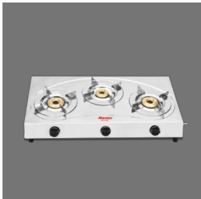
Three Burner Gas Stove Range