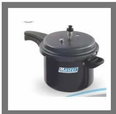
Hard Anodized Pressure Cooker