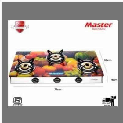
Master Fruity Glass Top Stainless Steel Glass Top 3 Burner Gas Stove