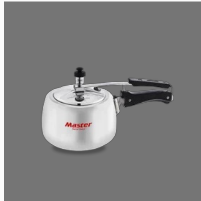
Master Marvella Aluminium InnerLid Apple Pressure Cooker