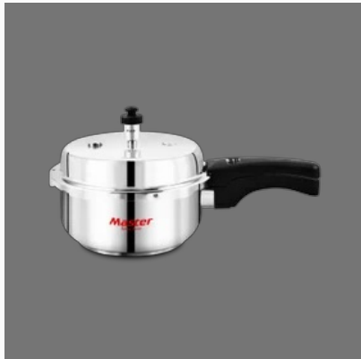
Master Stainless Steel Pressure Cooker