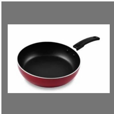
Master Non Stick Fry Pan