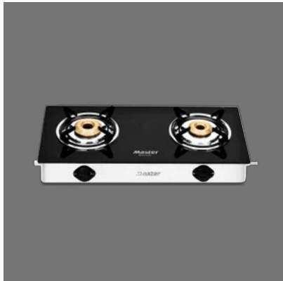
Double Burner LPG Stove