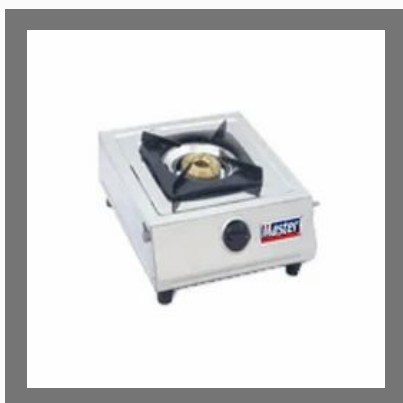
Single Burner Gas Stove Range