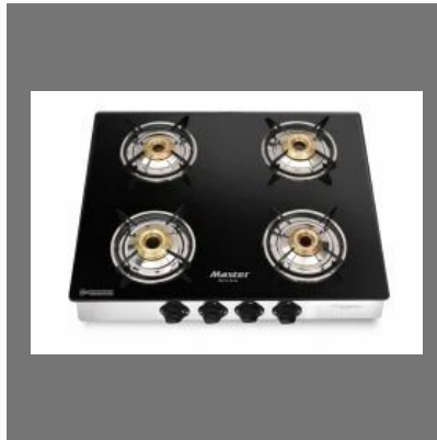
4 Burner Gas Stove Range