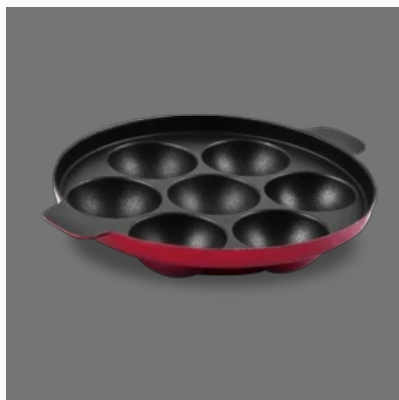
Non Stick Paniyarakkal