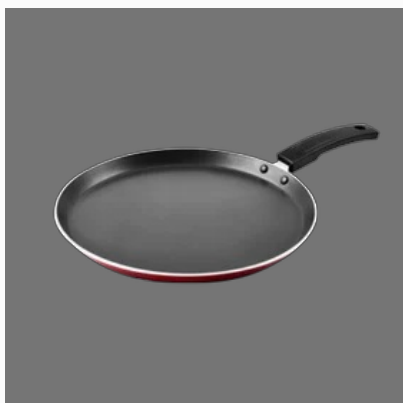
Master Non Stick Dosa Tawa