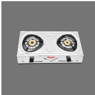
Double Burner Gas Stove Range