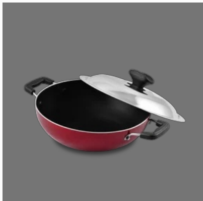
Master Non Stick Kadai