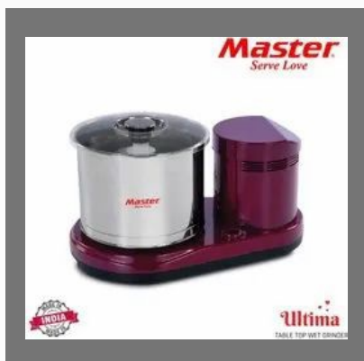
Master Ultima 2 Stones Wet Grinder (2 Liters)