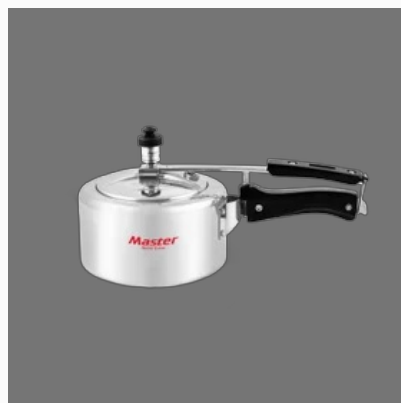
Master Aluminum Inner Lid Pressure Cooker