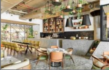
Fast Food Restaurant Consultant Services