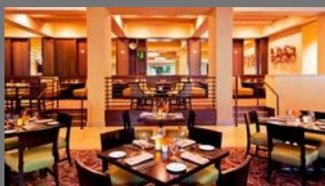
Food Court Setup Consultancy