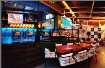
Cafe Bar Designing With Complete Set Up