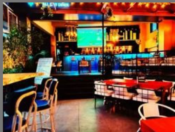
Cafe Set Up Consultancy Services