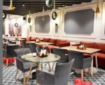
Restaurant Facilities Planning Service