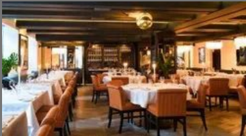
Hotel And Restaurant Consulting