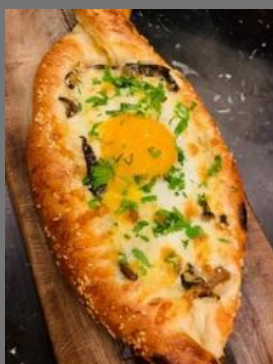
Bakery Setup Consultant