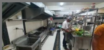
Cloud Kitchen Consultant