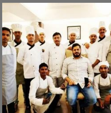
Staffs Supplier In Hotel Restaurant Cafe Qsr