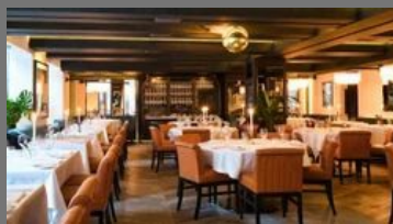
Hotel Management Consultancy Services