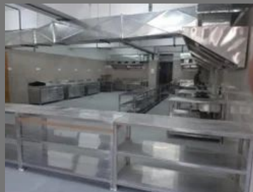
Commercial Kitchen Layout Planning