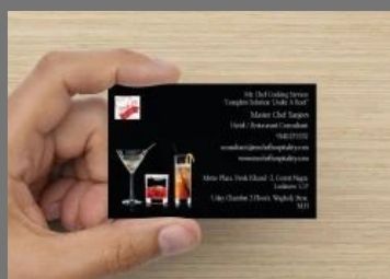
Menu Planning Restaurant Hotel