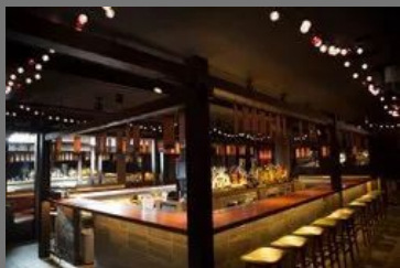
Lounge Bar Restaurant Set Up Consultancy