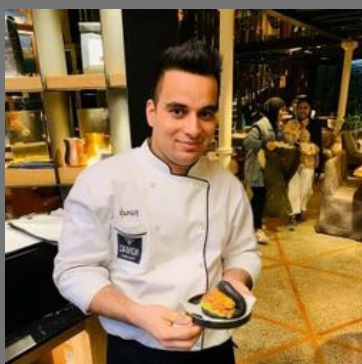
Cook Service For Hotel Restaurant Cafe Bar