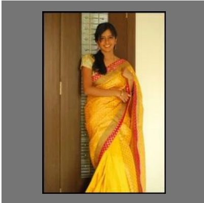
Designer Bridal Saree