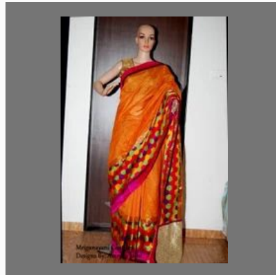
Printed Chanderi Silk Saree