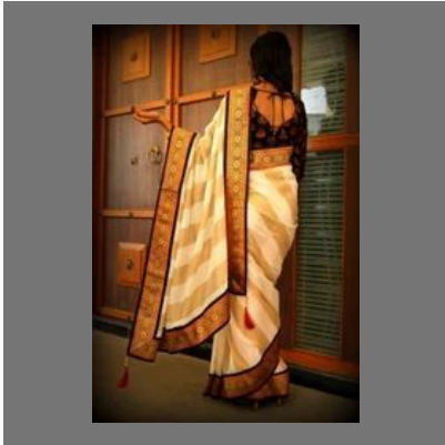
Indian Designer Sarees