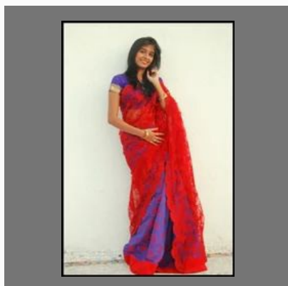
Designer Silk Sarees