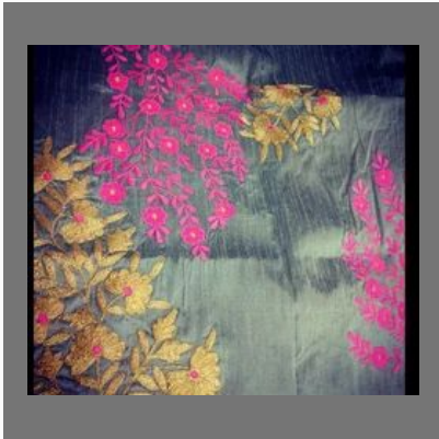
Zari Embroidery Suit