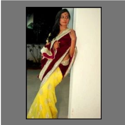
Fancy Designer Sarees