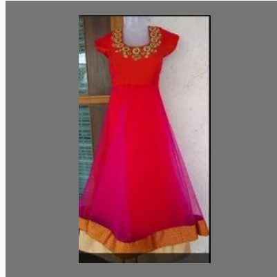
Maggam Work Embroidery Suit