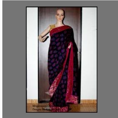
Black Banaras Silk Saree