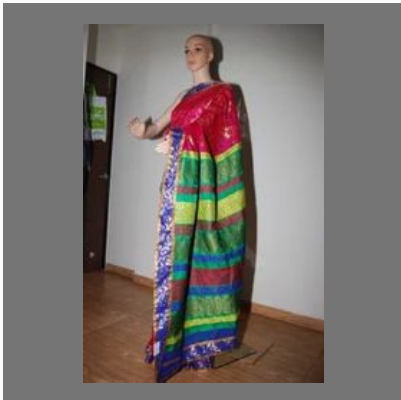
Banaras Saree With Heavy Woven Pallu