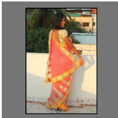
Designer Evening Wear Saree