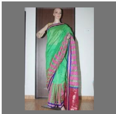
Chanderi Silk Saree