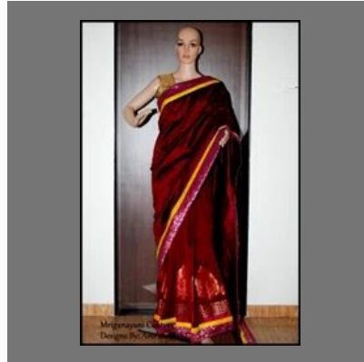
Chanderi Silk Saree