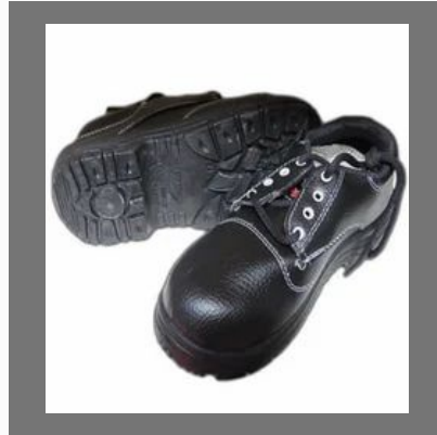
Prima Safety Shoe