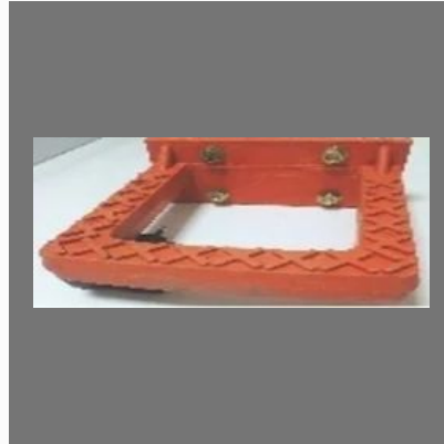
PVC Reinforced Anchor Rungs