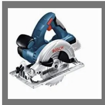
Bosch Circular Saw Gks 18V-57