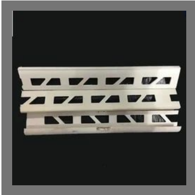
PVC Tile Beading