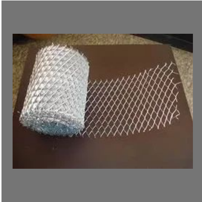
GI Plaster Mesh