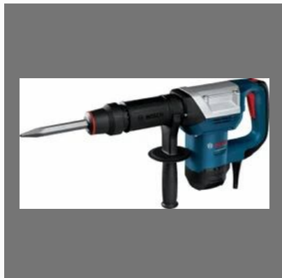
Demolition Hammer Bosch Gsh 500