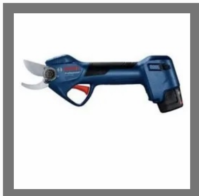
Bosch Pro Pruner GBA 12V 2.0Ah