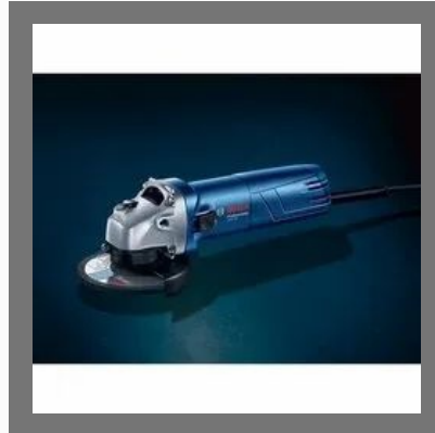
GWS-900-100 Professional New Small Angle Grinder