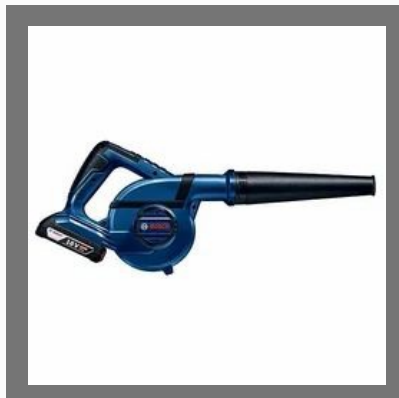
Bosch Blower Gbl 18V-120