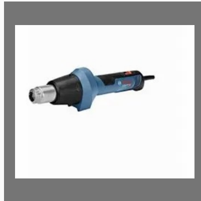
Bosch Heat Gun Ghg 20-60