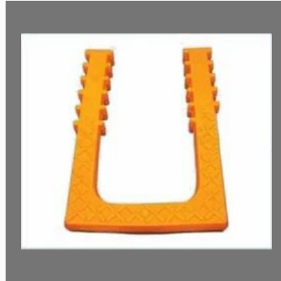
Pvc Foot Rungs