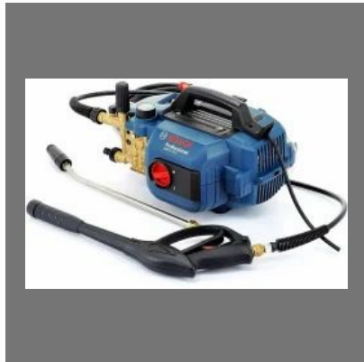
bosch High Pressure Car Washer GHP 5-13c