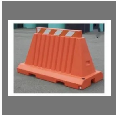
Water Filled Barrier