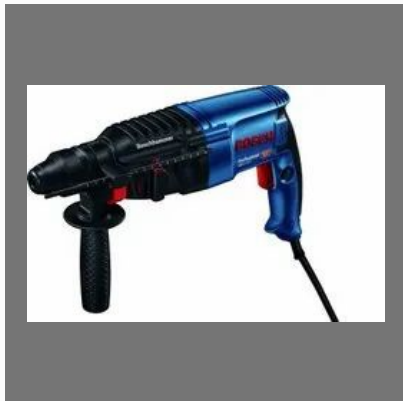
Hammering Drill Machine