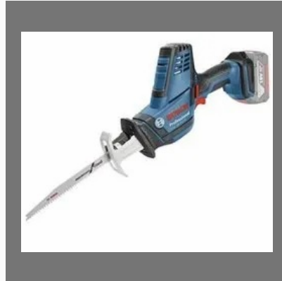
Bosch All Purpose Recipsaw Gsa 18V Li