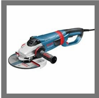
GWS-22-230 Large Angle Grinder