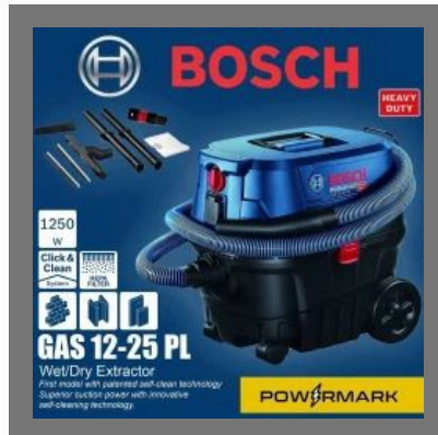
Bosch Dry Vacuum Cleaner GAS 15 - 25 PL