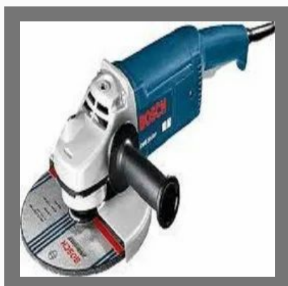
GWS-26-180 Professional Large Angle Grinder