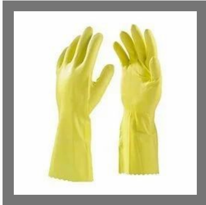
Rubber Hand Gloves