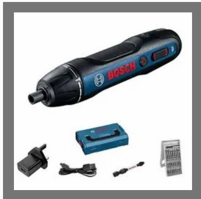
Screw Driver Go 2.0 Professional