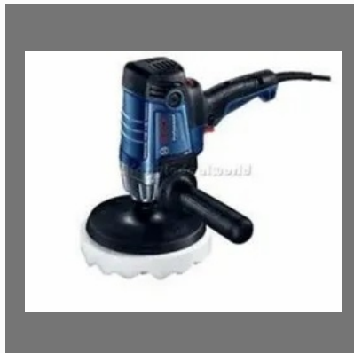
Bosch Metal Surface Finish Gpo 950