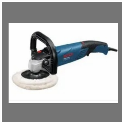
Bosch Metal Surface Finish Gpo 12 Ce