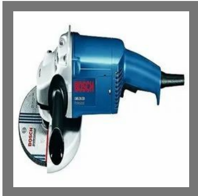
GWS-14-125 CI Professional Small Angle Grinder