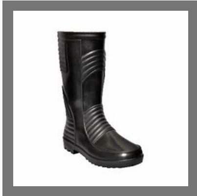
Leather Safety Gumboots