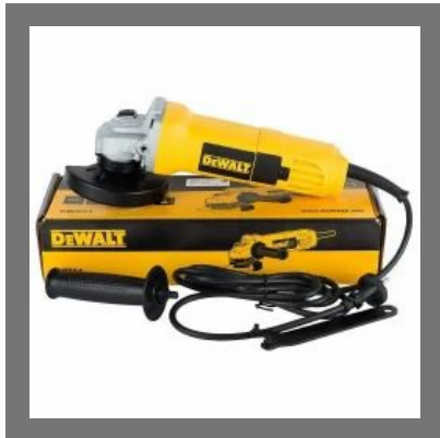
Dewalt Dw801 100 Mm Angle Grinder