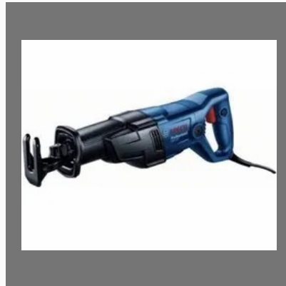
Bosch Recipsaw Gsa 120