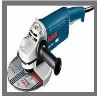
GWS-26-230 H Professional Large Angle Grinder