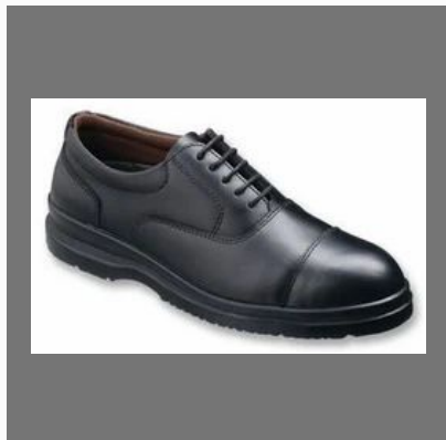
Oxford Type Safety Shoe with Steel Toe