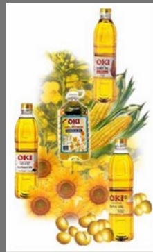
OKI Edible Oil