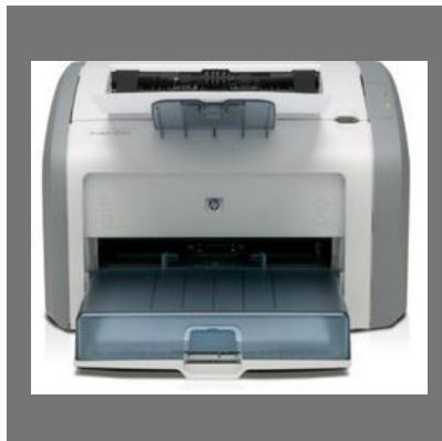
HP LaserJet 1020 Plus Printer