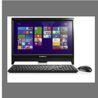
Lenovo C260 Desktop Black