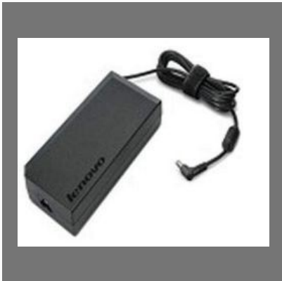
IdeaPad 170W AC Adapter