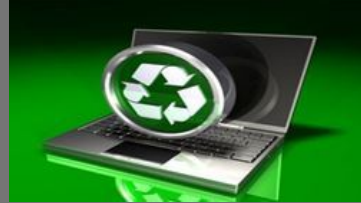
Data Security Considerations Services