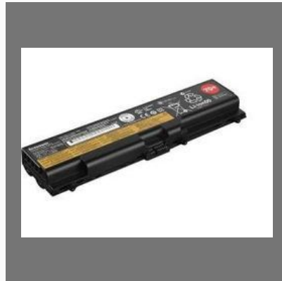
Lenovo T410 6 Cell Original Box Pack Battery